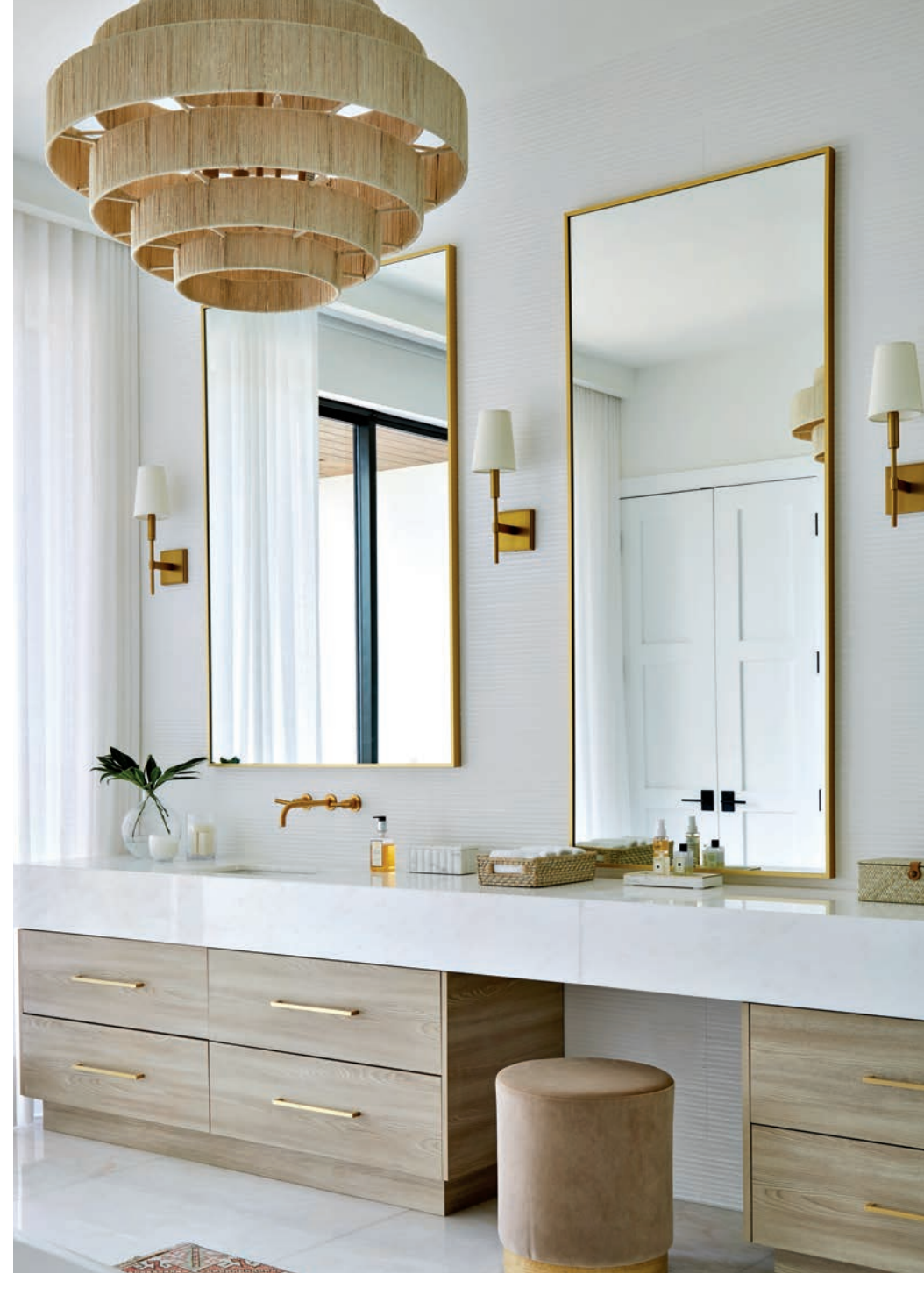
Above: A Palecek chandelier and Circa Lighting sconces offer light in the main bathroom. Cruz repeated Opustone Stone and Tile Concepts' Mystery White marble on the flooring as well as the countertops of the vanity's white oak base, wearing Schoolhouse's Edgecliff pulls. Kohler's Purist hardware and a stool by Premium Upholstery complete the look.

Left: Four Hands armchairs and a Nuevo side table pair with a bed and nightstands by RH in the main bedroom. Kelly O'Neal artwork adds a striking touch, as do the pendants and overhead light by Visual Comfort. Draperies by Kasas Interiors and a grass-cloth wallpaper by York Wallcoverings inject an ethereal feel. A vintage Turkish rug offers texture on the Bella Citta flooring.