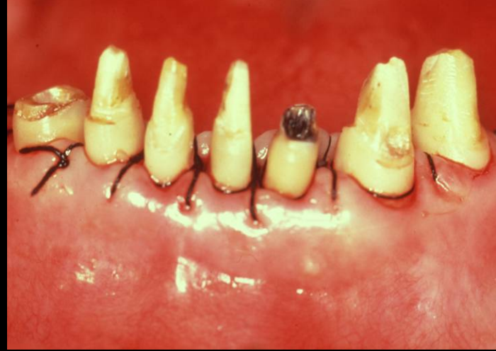
Crown Lengthening to Increase Tooth Structure Prior to New Restoration