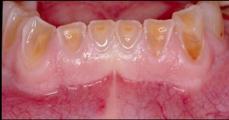
Crown Lengthening to Increase Worn Down Tooth Structure Prior to New Restorations