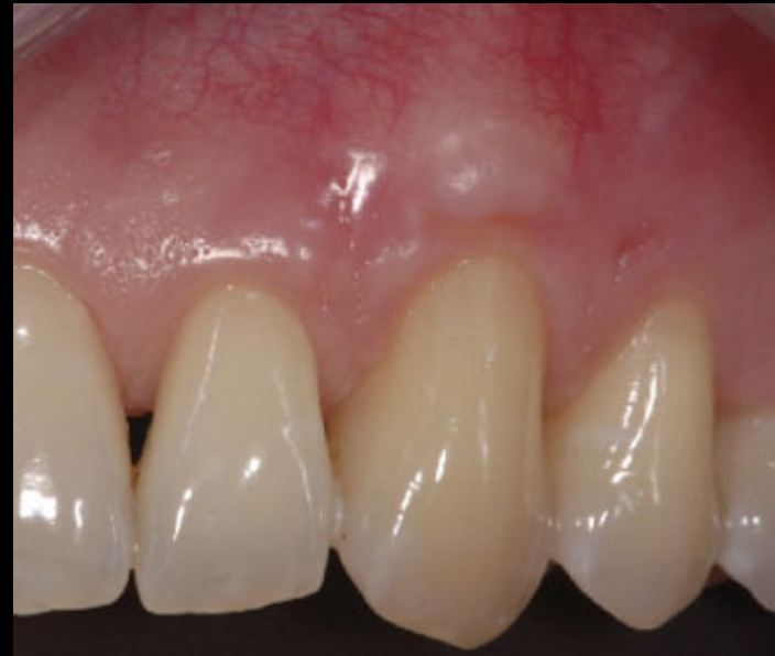
Long - Term Result of Soft Tissue Grafting (Gum Grafts). 16 years