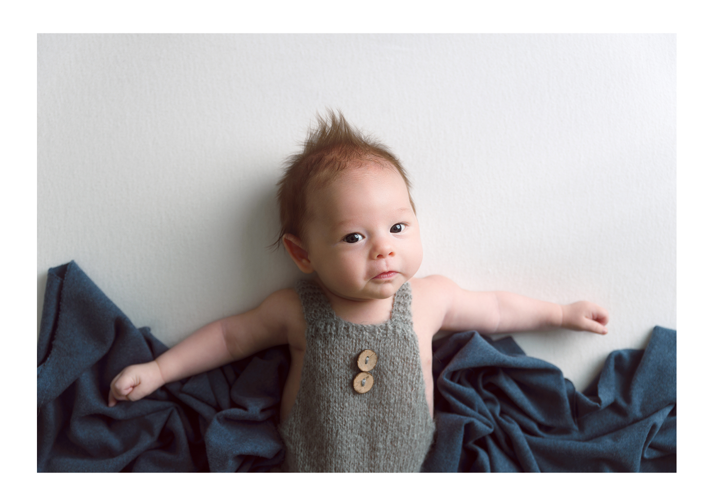
I can't wait to work with you!