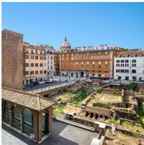
PANTHEON CAESAR RELAIS Largo Ginnasi, 2, 00186 Roma RM, Italy