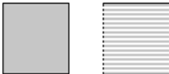
Figure 2: Illustration of the difference between standard and segmented electrode. Standard electrodes are made of compact material as a single piece (left), while the segmented electrode is composed of multiple interspaced segments (right).

of 56 smaller segment pairs, with each segment pair laid out close to each other, creating individual positive and negative (+/-) RF poles (112 segments per applicator). The main purpose for using this segmented design and for having multiple interspacings is to achieve selective tissue heating effects as with large-sized solid electrode but without the technical limitations associated with a solid electrode (see Figure 2). The device utilizing this technology offers two treatment applicators, allowing a total of 224 interspaced electrode segments to work in synchrony during the treatment (Figure 2).