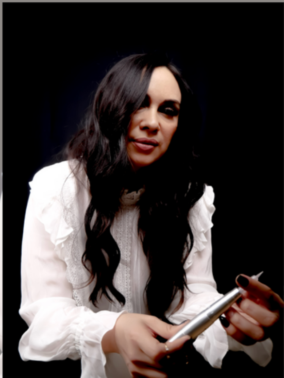
AMIEA GLOBAL TALENTS 2019