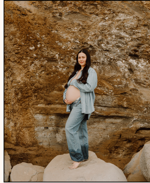
SCRIPPS PIER LA JOLLA. CA