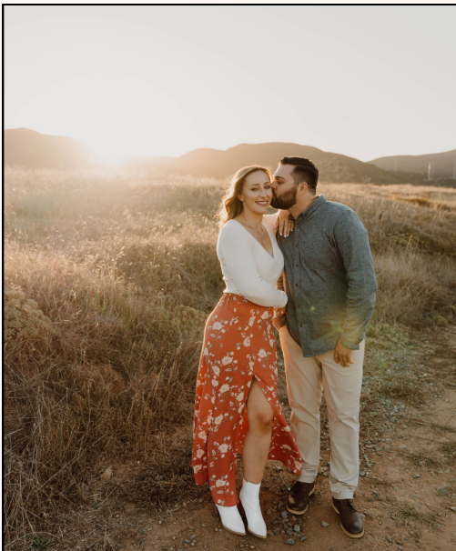
MISSION TRAILS SAN DIEGO. CA