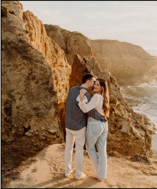
SUNSET CLIFFS SAN DIEGO. CA