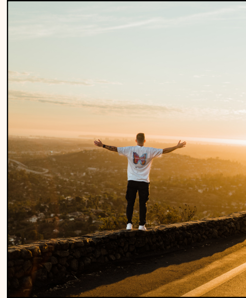
MOUNT HELIX LA MESA. CA