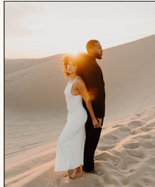
GLAMIS SAND DUNES IMPERIAL, CA