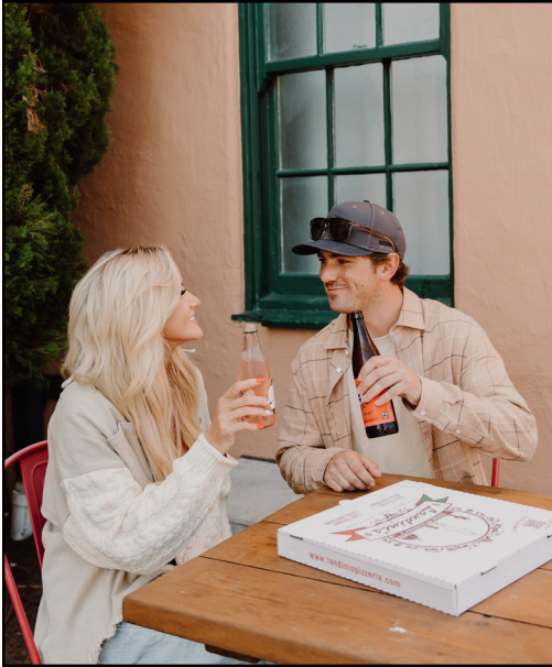
LIBERTY STATION SAN DIEGO. CA