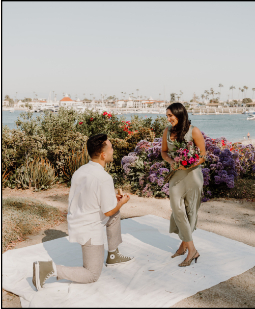
POINT LOMA SAN DIEGO. CA