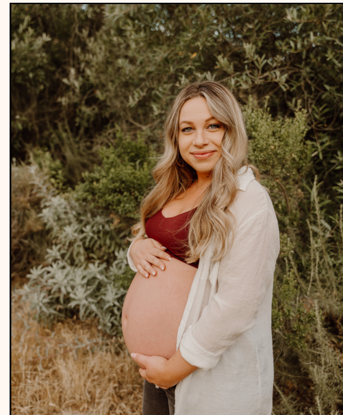
MARIAN BEAR PARK LA JOLLA. CA