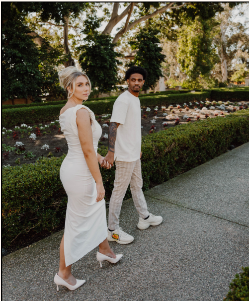
BALBOA PARK SAN DIEGO. CA