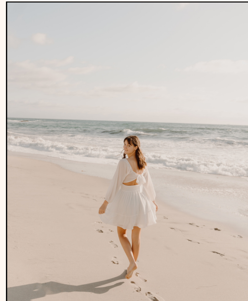
MARINE ST. BEACH LA JOLLA. CA