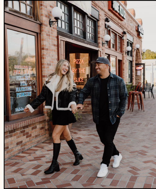
PACIFIC BEACH SAN DIEGO. CA