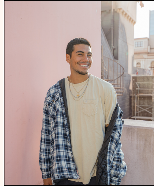
DOWNTOWN SAN DIEGO. CA