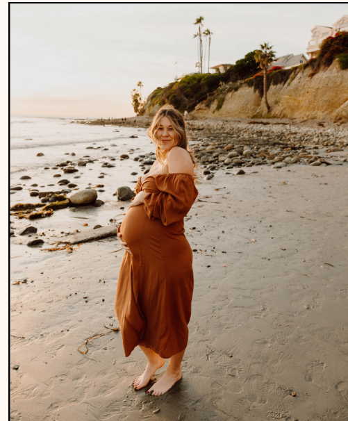
TOURMALINE BEACH SAN DIEGO. CA