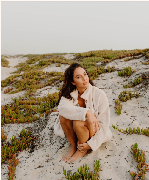
CORONADO ISLAND SAN DIEGO. CA