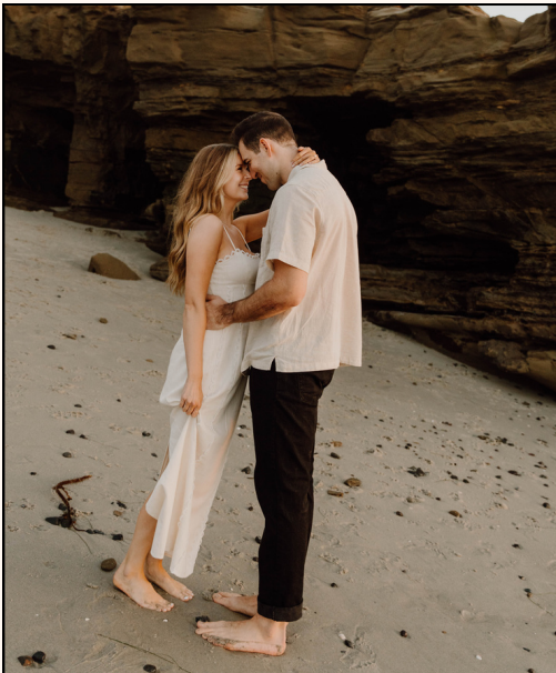
WINDANSEA BEACH LA JOLLA. CA