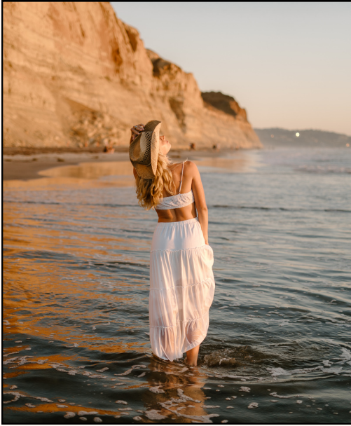
TORREY PINES BEACH LA JOLLA. CA