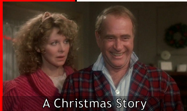
A Christmas Story

In those moments when we move beyond our chronic selfishness to focus on those we love, we discover the truth in what Jesus said: "it is more blessed to give than to receive".