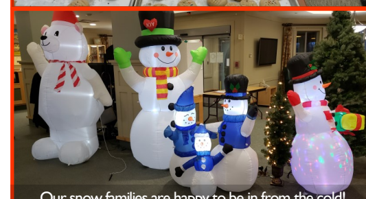
Our snow families are happy to be in from the cold!