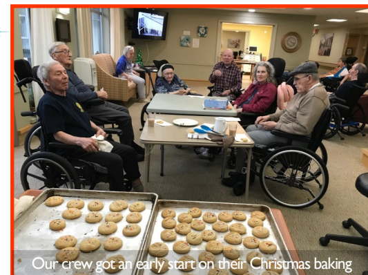
Our crew got an early start on their Christmas baking