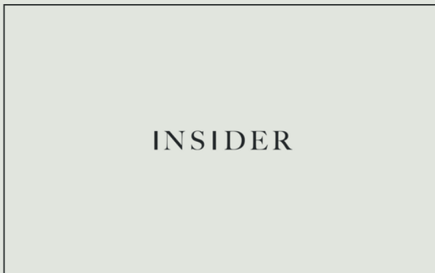
BLOCK COLOUR STORY HIGHLIGHT