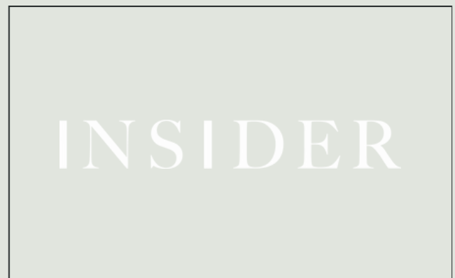
SECONDARY LOGO WHITE

Good for socials, marketing materials, merch, and informal branding where a shorter logo is needed.