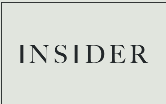
SECONDARY LOGO DARK