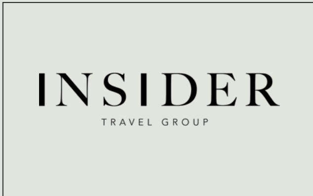
PRIMARY LOGO DARK

Alternatively, request access to full Google Drive with all png logos HERE . Or download this document to use the logos directly in Canva HERE