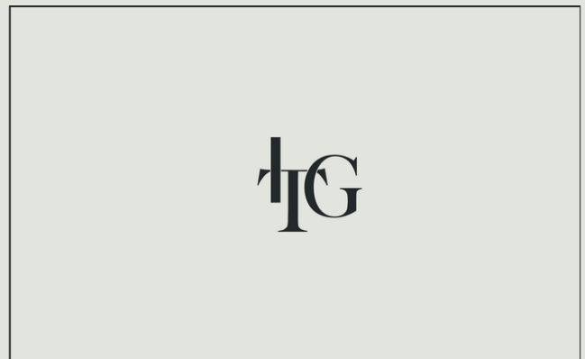
BLOCK COLOUR STORY HIGHLIGHT