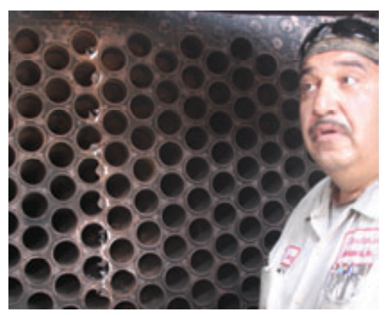
Standing in the smokebox next to the front tube sheet, a Chardans Mechanical boiler specialist begins tube removal instruction. The tubes are swaged or crimped at this end. Each tube must be collapsed at this end, cut free at the rear tube sheet, and pulled out through the smokebox.

Williams offered the services of his boiler specialists to teach a collection of volunteer workers to remove the flue tubes.