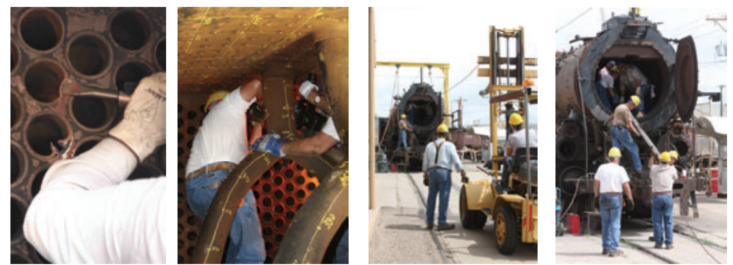
Tube removal steps: 1: Working in smokebox to collapse swaged tube at front tube sheet. 2: Working in cramped firebox space and using internal cutting tool to cut firebox end of tube. 3: Using forklift and cable to pull tube. 4: First tube removed from smokebox.

Assistance to the 2926 restoration effort actually began when several Albuquerque City Departments, and city employees showed confidence in our capability by helping NMSL&RHS acquire 2926. Since then, many businesses, organizations, groups and individuals have contributed in one way or another. Donated or discounted service, tools, equipment, and materials, along with assistance in acquiring support have contributed to our restoration work. Cash donations ranging from a few dollars from a German rail fan to $5000 sent by an anonymous British rail enthusiast, have supplanted dues and contributions from the NMSL&RHS membership. Here are a few of our supporters. Others will be named later.