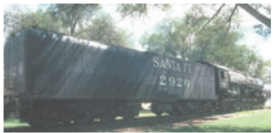
The tender before removal from Coronado Park: It experienced abuse from natural elements and vandalism, but New Mexico's high, dry climate saved it from more severe deterioration. <u>Come to the October 18 Open House and see what it looks like now.</u>

Among the largest tenders ever built, the 2926 tender now has a shiny new coat of Dupont Imron paint. Santa Fe lettering and numbers will be added well before the Open House.