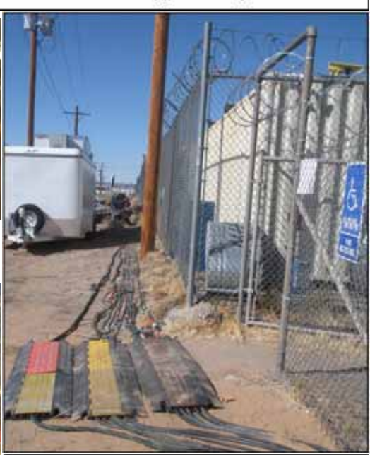
Power cables everywhere. This is the walk-in gate on the south side of the MMSLRHS site. The Gaffer (movie term for electrical guru) and his crew made short work of wiring and lighting the entire site.