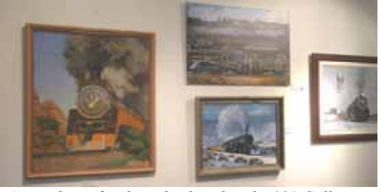
A sampling of rail art displayed at the 105 Gallery.