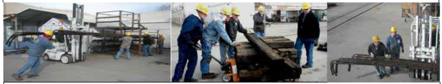
Preparing the site for the movie shoot. There was a lot of lifting, pushing and moving for a couple of days prior to the shoot—then putting everything back in place after the shoot. It wasn't an easy job, but it produced $$$ for the restoration, and we now have a much cleaner site.

Here, and on the back page are some pics from the site preparation, and the February 1 movie shoot.