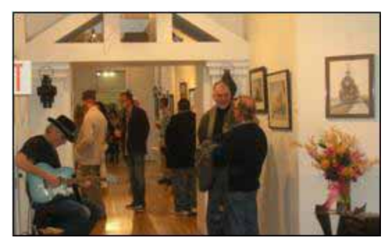
Opening night: Rail art fans view art and chat.

The pictures below depict the response from art and rail fans.