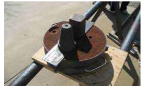
The flat for the mold consists of two parts. Photo 1, Robb packs sand into the bottom half. Photo 2, Robb removes pattern to reveal void that will create plate. Photo 3, both parts of flat in place ready to pour. Note the holes: One is a gate for the molten bronze, the other to vent hot gases.