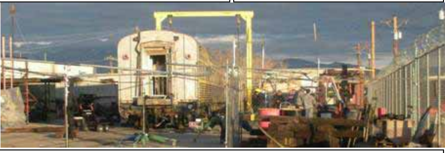
Sunset on the set: Only hours before shooting was to begin, grips, gaffers, and NMSLRHS members scramble to get everything in place for tomorrow's shoot.