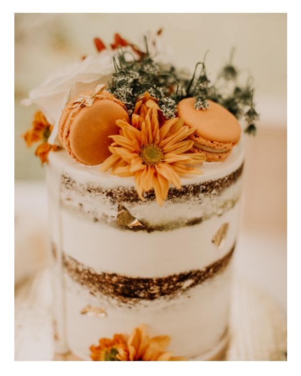
$20 - 4" Round Cake $40 - 6" Round Cake $80 - 4" plus 6" Tiered Cake

Blue House desserts are always made from scratch, with the highest quality ingredients and Vermont products whenever possible.