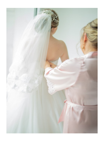
Additional Coordinator $135