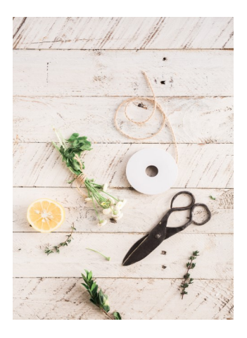
DIY Help Dependent on Project

Other add-ons not listed will be at the discretion of Lazuli Picnics Co. LLC