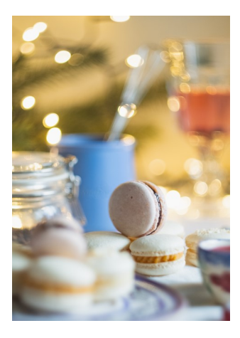
Snacks for Bridal Party $10/Person