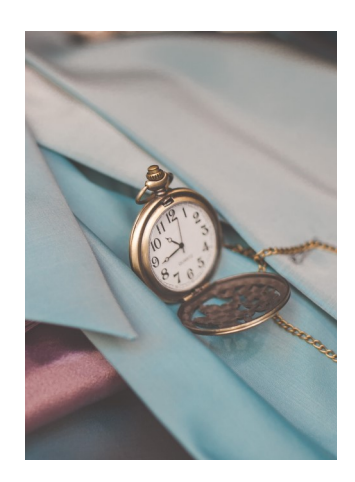
Additional Hours $40/Hr