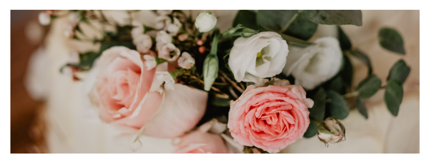
The Other Details:

Day of Wedding Coordination Package starts at $650 with no add-ons.