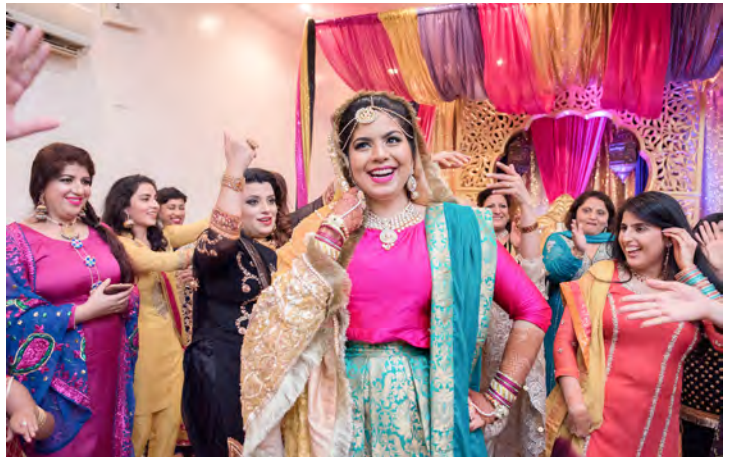
Pre-Wedding Event Photography