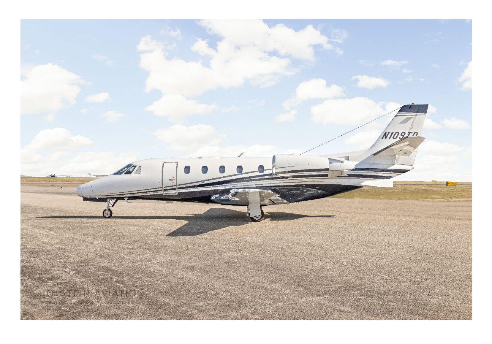
Specifications subject to verification upon inspection. Aircraft subject to prior sale without notice.