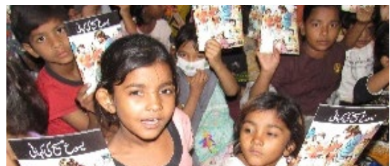
Distribution of Children's Bibles in Urdu

One pastor testified to establishing Sunday schools across numerous villages, using PSSM's resource kit: children's Bibles in Urdu, Bags of Blessings, and coordination with Samaritan's Purse. The strategic integration of tools and training ensures not only the reach but the depth of discipleship.