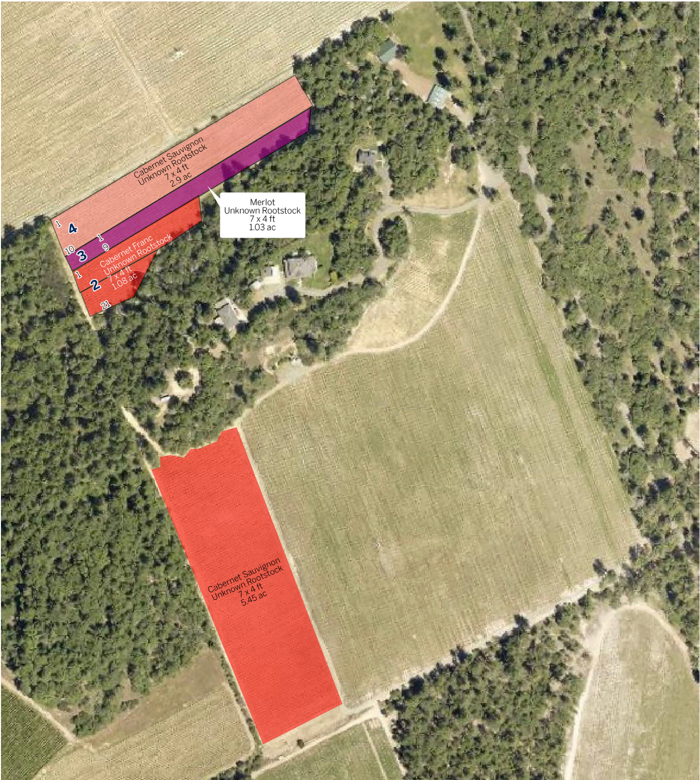
Blocks 2 & 3 Map