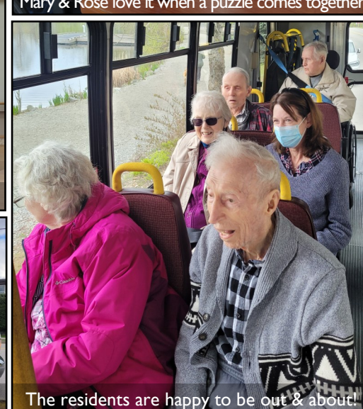
The residents are happy to be out & about!