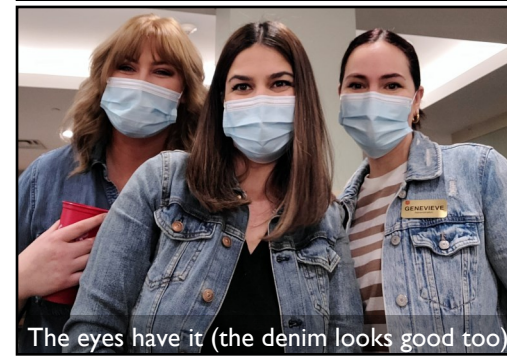
The eyes have it (the denim looks good too!)