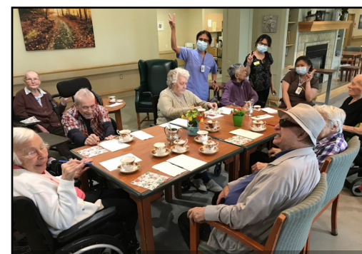
Magnolia puts the "party" in a tea party!