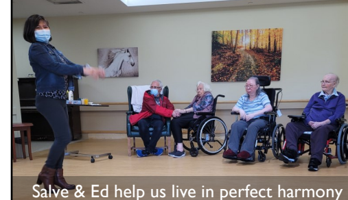
Salve & Ed help us live in perfect harmony