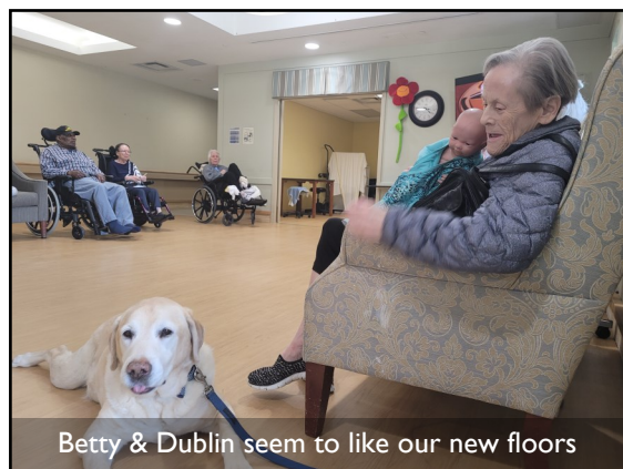
Betty & Dublin seem to like our new floors