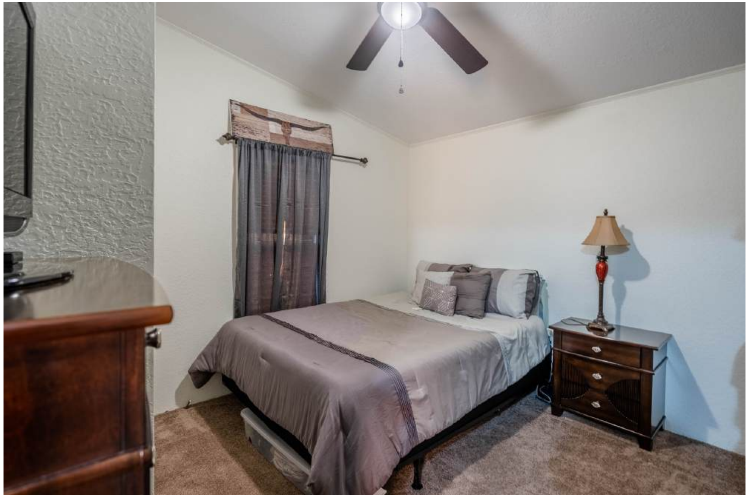
CAPITAL REALTY GROUP AT FATHOM REALTY