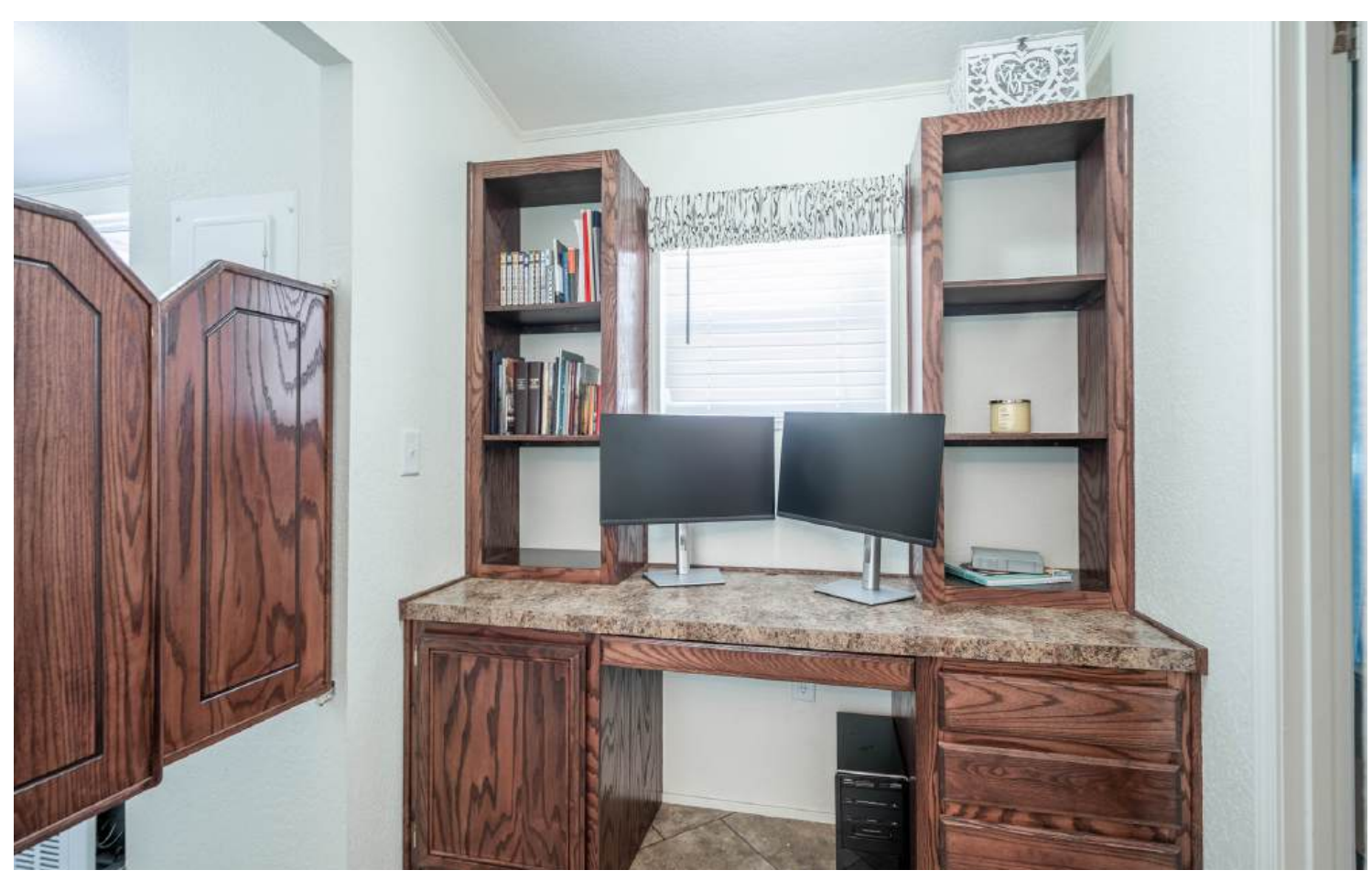
CAPITAL REALTY GROUP AT FATHOM REALTY