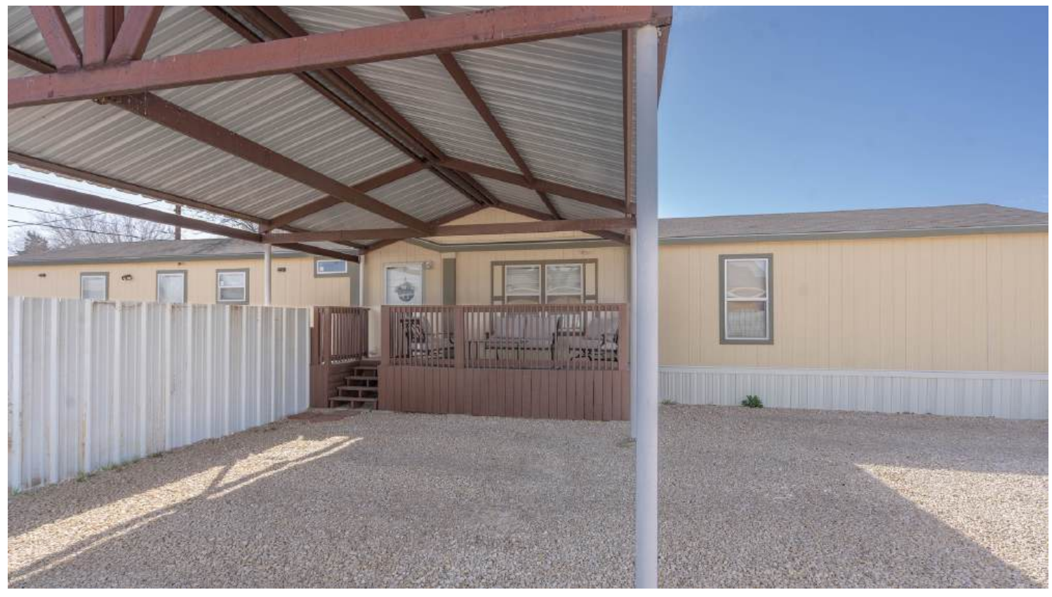
CAPITAL REALTY GROUP AT FATHOM REALTY