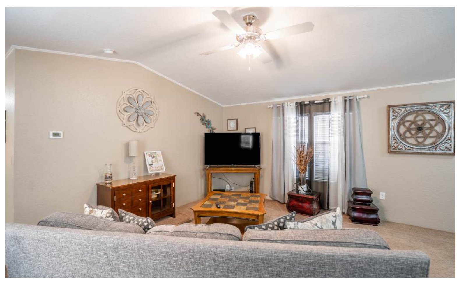
CAPITAL REALTY GROUP AT FATHOM REALTY