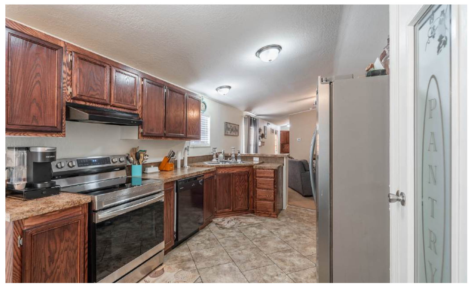
CAPITAL REALTY GROUP AT FATHOM REALTY