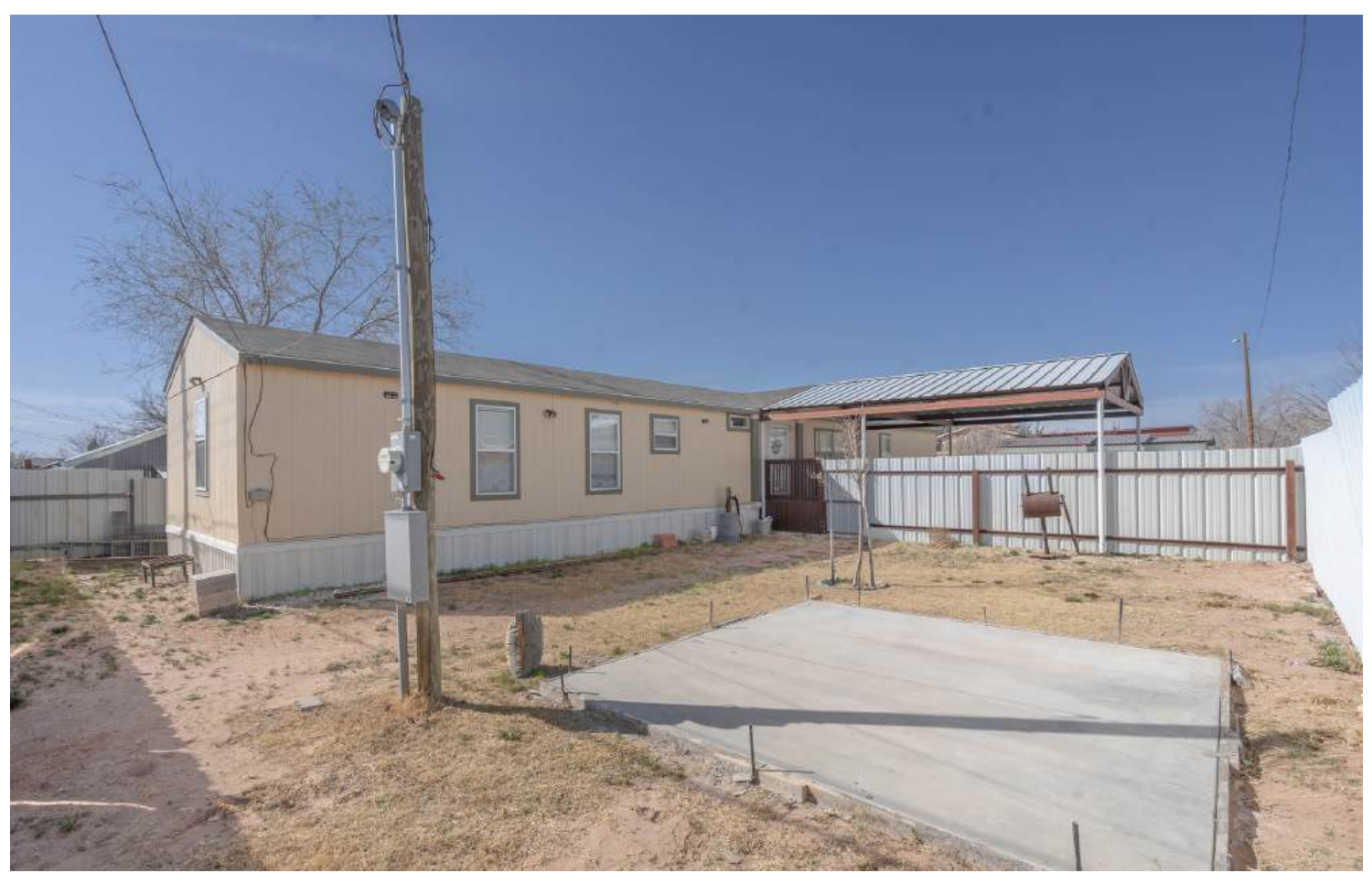
CAPITAL REALTY GROUP AT FATHOM REALTY