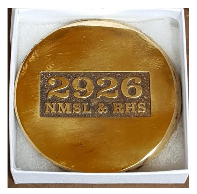
MINEATURE (3 inch diameter ) 2926 BUILDER PLATE MEDALIONS cast in bronze by the Society's Longbeards are available at the gift shop for $85.

NMSL&RHS P.O. Box 27270 Albuquerque, NM 87125