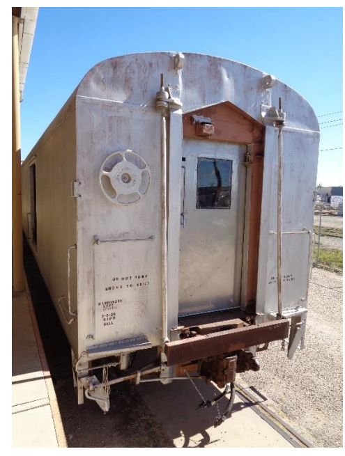
The 80 Kw generator is mounted under #3939. Next job: The fuel tank.