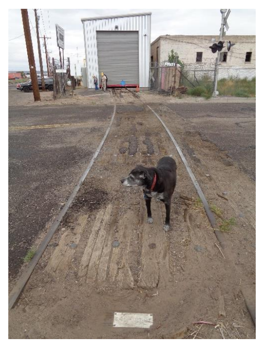
1937 vintage 8th St. crossing.

Green shows the NMSL&RHS spur with upgrades paid for by the Society. On the restoration site itself the track was re-laid in 2014 with an anonymous donation of $100,000. The green segment between 8<sup>th</sup> street and the siding switch was upgraded to Class 2 in 2018 by the Society for about $25,000.