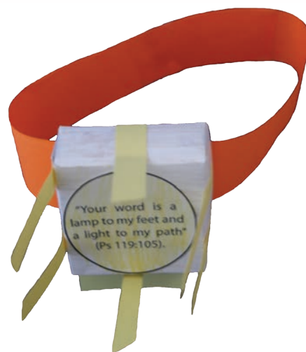
A Light to My Path See Year 2 Craft Book, Book 1

Directions: Pre-cut objects from craft sheet. Pre-cut yellow paper into strips for light beams. Pre-cut long strips (1 in wide) of regular paper to serve as a headband. In class, help students to fold the box template into a box. Create a headlamp by gluing the headband, verse, and light beam strips onto the box.