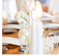
Reception Details 5:30-5:50

If the reception is in the same location as the ceremony, I can use the time as the guest first arrive to photograph reception decor untouched. If the reception is at a different location, I can often use the cocktail hour for this purpose.