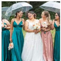
Bridal Party Portraits 4:50-5:20

Bridal Party time! I allow extra time throughout the day just in case we have some unexpected things that hold us up. One way to make sure we stay on schedule for bridal party portraits is to have someone put the boutonnieres on the guys before they arrive for photos.