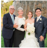
Family Portraits 6:40-7:10

Family formals normally take place immediately following the ceremony. It's best to save all the family formals until after the ceremony because all the members will be present at one time. We'll need about 30 minutes. I send a questionnaire before the wedding where the couple can list all the groupings they will want.