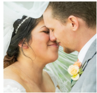
First Look 4:00

This is one my favorite parts of the wedding day! I will find the perfect location for my couple's First Look prior to the moment. We will be sure to find a place that is as secluded and private as possible.