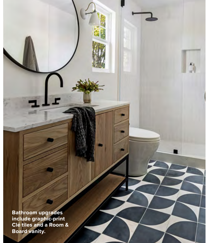
Bathroom upgrades include graphic-print Clé tiles and a Room & Board vanity.