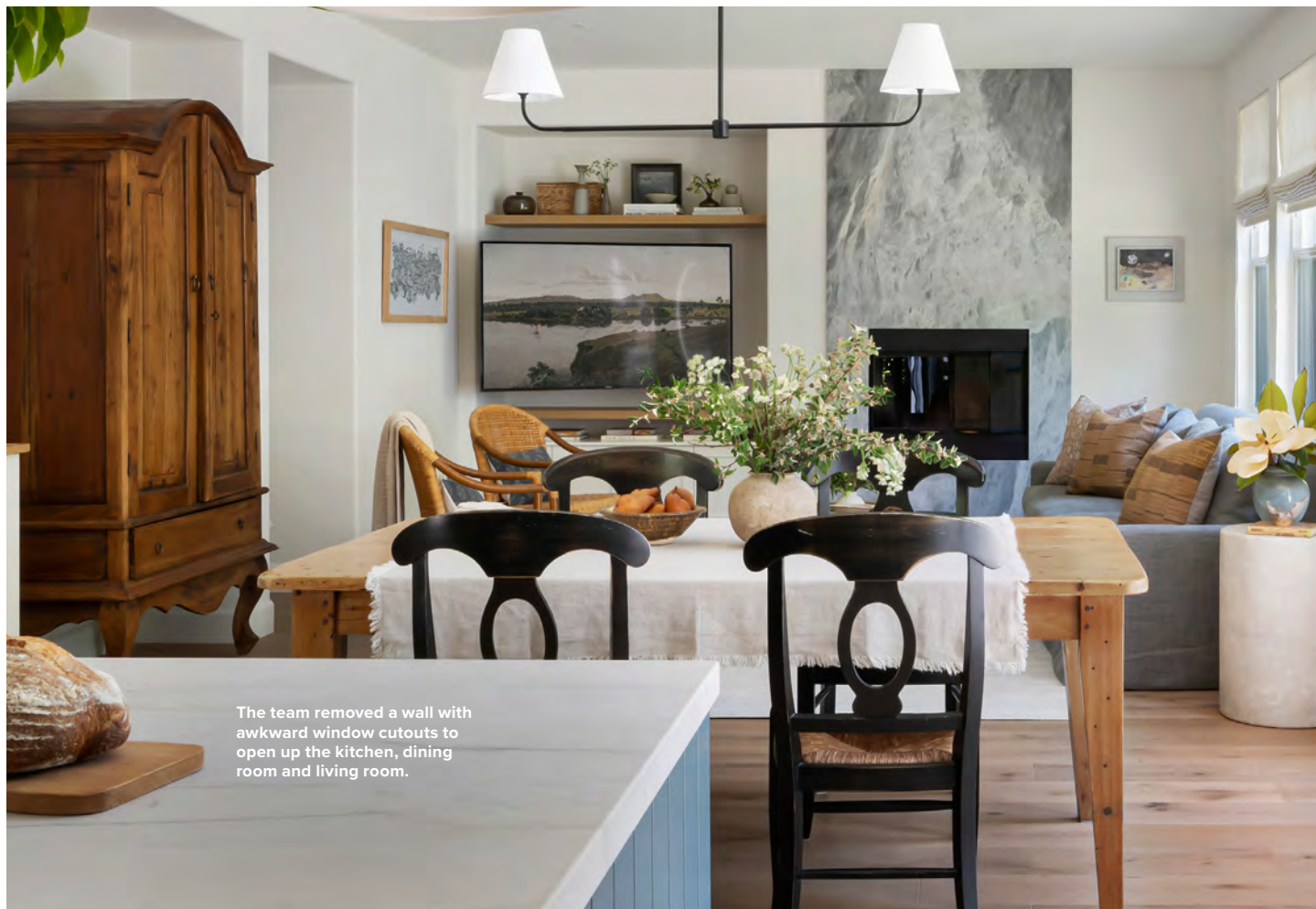
The team removed a wall with awkward window cutouts to open up the kitchen, dining room and living room.