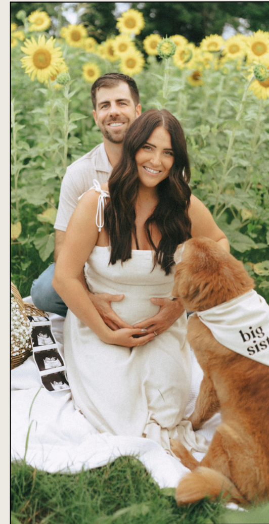
Inspo Board for Mammamas