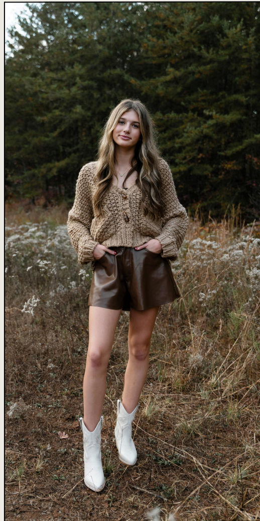
Inspo Board for Girls