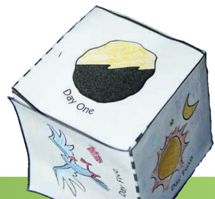
Creation Cube See Year 1 Craft Book, Book 1.

Directions: Pass out a craft page to each child. Tell the children to color each picture of the days of creation. After coloring, tell the children to cut around the outside of the cube pattern on the solid lines. Model how to fold the cube on the dotted lines and then help children make the correct folds and glue the tabs to assemble the cube.