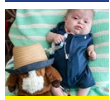
Teams raising $5,000+ (Entered for drawing for picture on billboard)

Team with most new registered walkeras in two weeks (Picture on Save the Date)