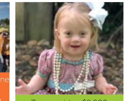
Teams raising $2,000 (Entered into drawing for cover photos on Winter 2018 magazine)