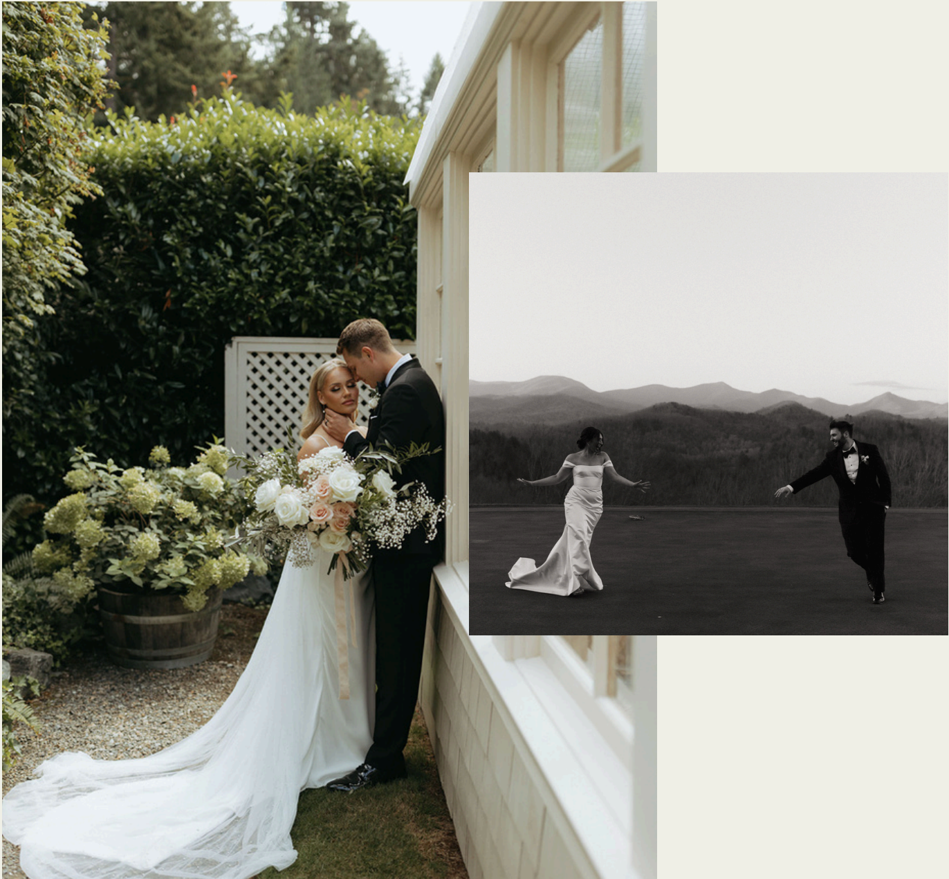
IMG. / REF. 001