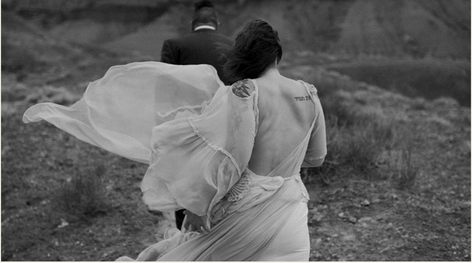
IMG. / REF. 003