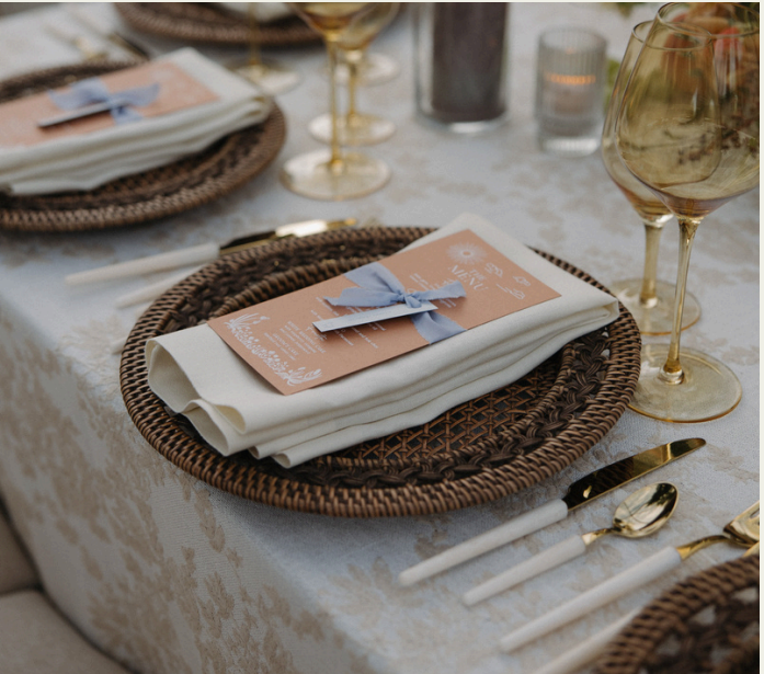
IMG. / REF. 002

This is an experience far beyond just photos. I want you to remember the way the wind felt on your cheeks, and how the warmth of the sun felt on your arms. I want to capture that look he gives you when you say your vows. Every tiny, seemingly insignificant detail.