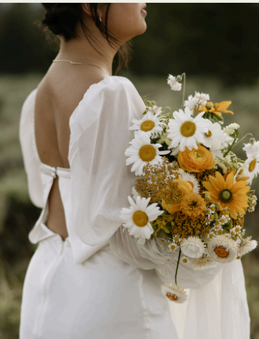
IMG. / REF. 003