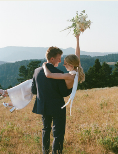
IMG. / REF. 002

GREAT Q. MY CAMERAS HAVE A DUAL SD CARD SLOT WHICH MEANS I CAN SHOOT ON TWO CARDS AT THE SAME TIME. THAT'S THE FIRST LEVEL OF PROTECTION. AFTER EVERY WEDDING, I IMMEDIATELY BACK THE PHOTOS UP ONTO ONE OF MY HARD DRIVES THAT I KEEP WITH ME AT ALL TIMES. BY NOW, YOUR PHOTOS ARE ON THREE SEPARATE LOCATIONS! ONCE I GET BACK IN OFFICE, I THEN BACK YOUR PHOTOS UP ON A DRIVE THAT ALWAYS STAYS AT MY HOUSE SO THERE IS NO RISK OF LOSING IT! I ALSO NEVER DELETE FILES OFF OF SD CARDS UNTIL THE FINAL GALLERY IS DELIVERED!