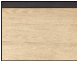
A sample of the new vinyl plank flooring.