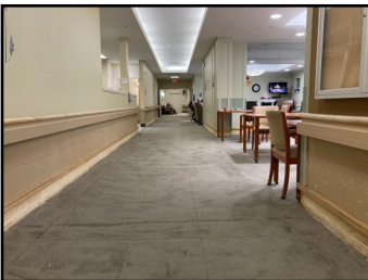
The look as the old carpet and linoleum are removed.

Thanks to generous extra contributions through Fraser Health, we were able to raise all the funding needed to replace high traffic flooring in the resident common areas with new beautiful, durable and cleanable vinyl plank flooring. Over the next few weeks be patient as we watch the transformation unfold!