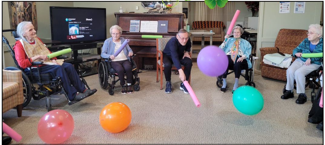
Buchanan's "racketball" should be Canada's national sport - much softer & safer than hockey!