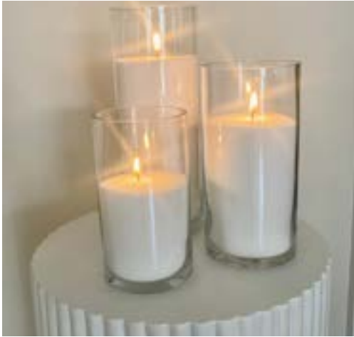
Set of 3 white sand candles