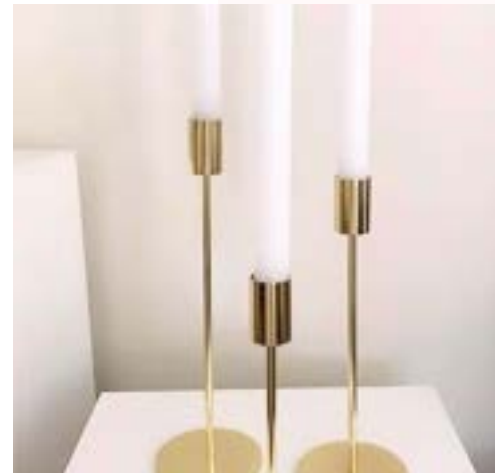
Gold dinner candlesticks with glass sleeve