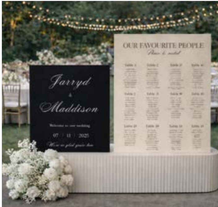
Signage with base