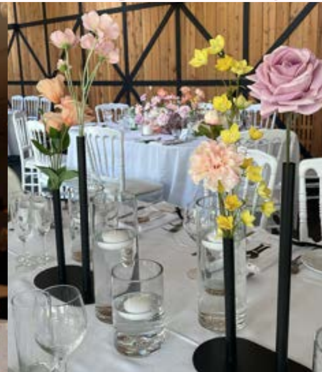
Tubevase Available in black or white