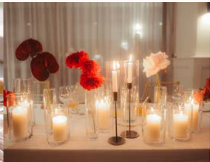
Glass stem vase