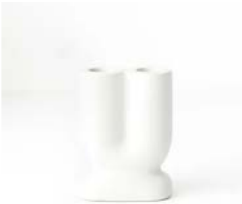
White taper candle holder