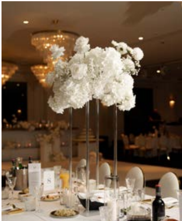
Floating arrangement Available on clear or gold stand