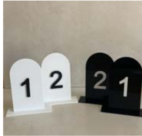
Acrylic table numbers