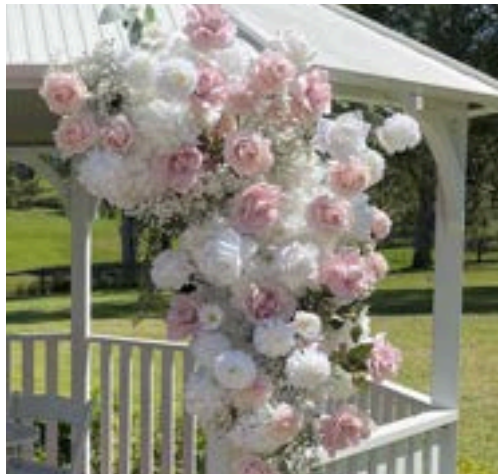
DAINTY White, soft pink, quicksand, baby's breath with greenery