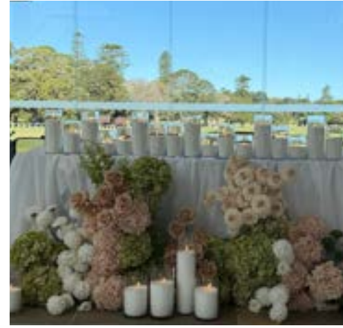
MEADOW Ivory, cream, blush and green