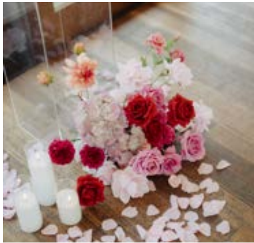
ROMANTIC GARDEN Fuchsia, red, magenta and light pink