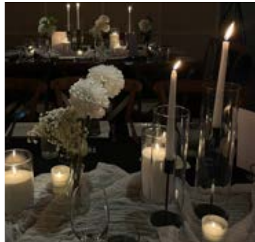
Black dinner candlesticks with glass sleeve