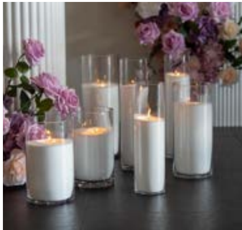
Floor size white sand candles