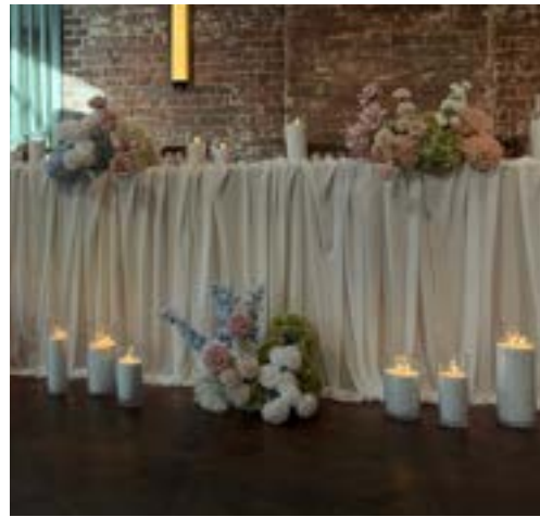
BLUSH AND BLOOM Quicksand, blue, green and white