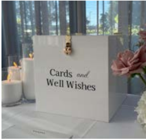
White wishing well