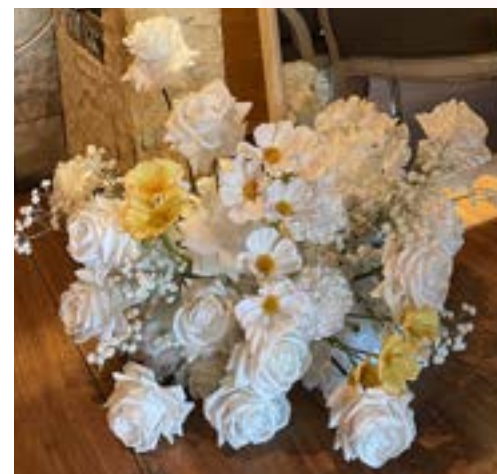
YELLOW White and cream with touches of yellow