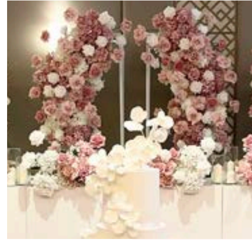
ELEGANT dusty pink, soft pink and white