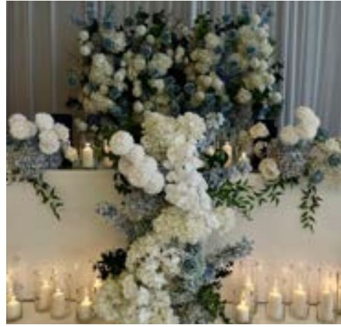
BLUE HUES White with blue and greenery