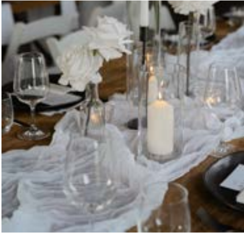
White cheesecloth table runner