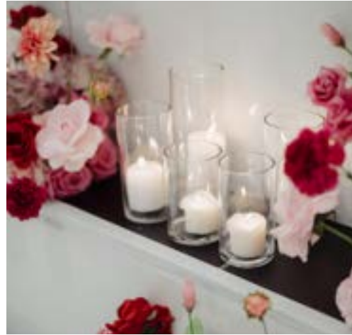
Set of 3 hurricane candles