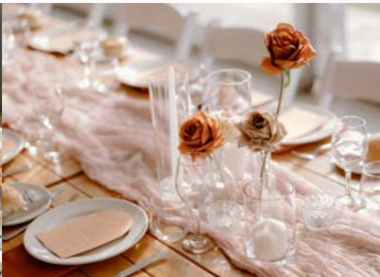
Set of 3 bud vases