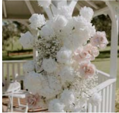
MINIMAL white with quicksand and baby's breath