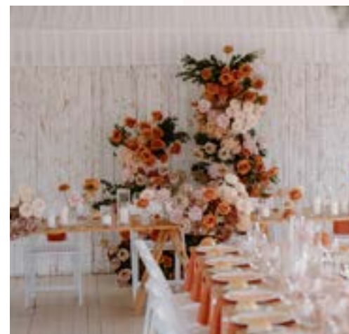
MODERN BOHO Cream, coffee, toffee, blush and quicksand