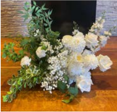
CLASSIC white with greenery