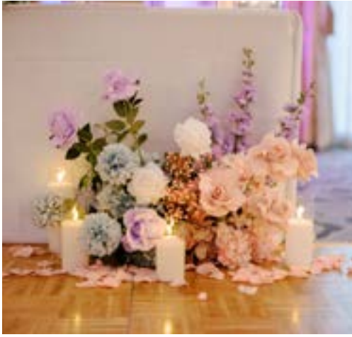
BRIDGERTON Pastel pink, purple, blue and white