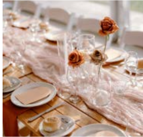
Quicksand cheesecloth table runner