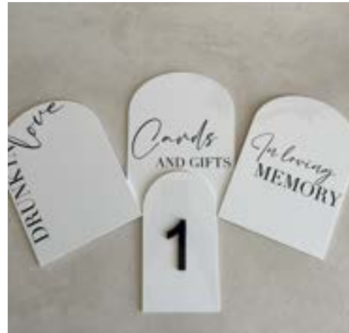
Acrylic signage Bar, wishing well and In loving memory