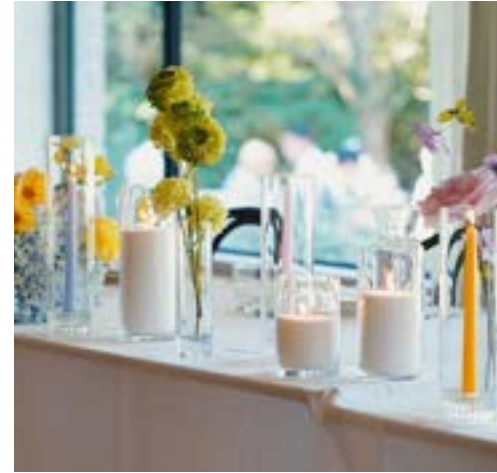
Coloured taper candles - pink, purple, blue and yellow