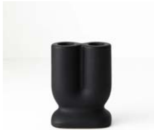
Black taper candle holder