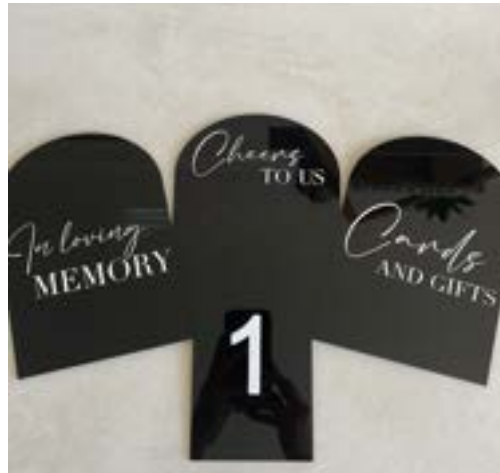
Acrylic signage Bar, wishing well and In loving memory