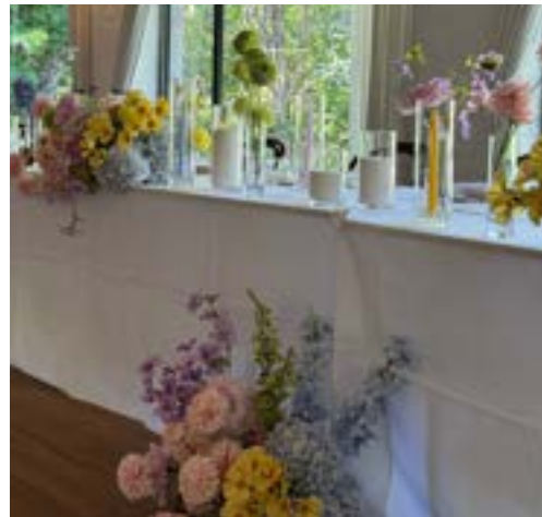
PASTEL Pink, purple, yellow, blue and green