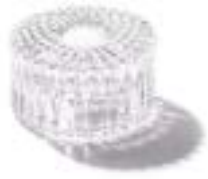
Crystal dinner candlestick