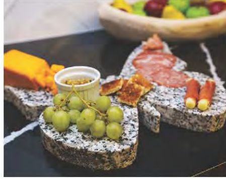
Customized Cutting Boards