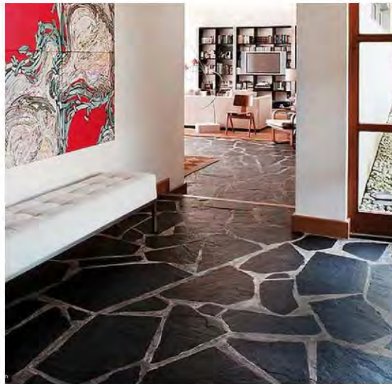
Natural Stone Tile