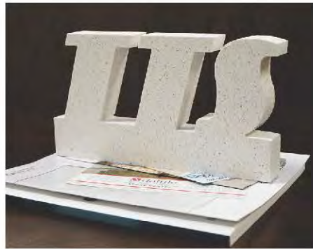
Personalized Stone Products