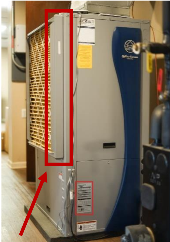
Remove filter housing door

Ensure geothermal unit is turned off before proceeding! You can turn off the unit at the thermostat ( MODE > OFF ).