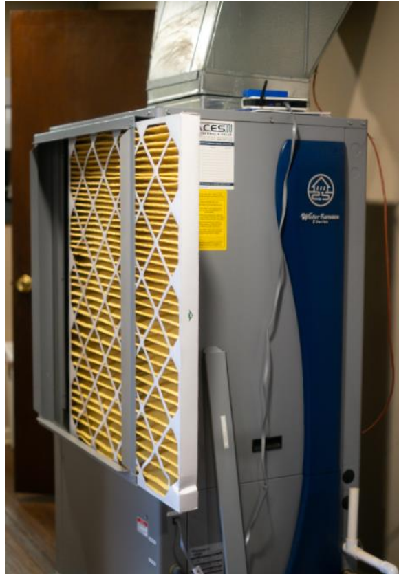
Remove Old Filter