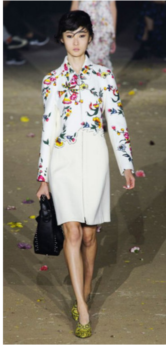
3.1 Phillip Lim