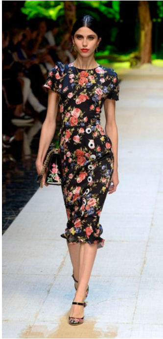
Dolce and Gabbana