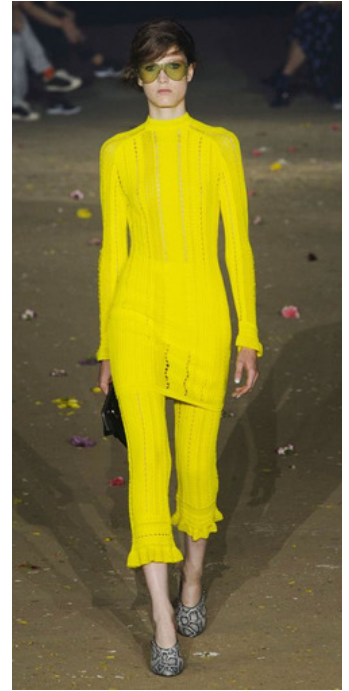
3.1 Phillip Lim