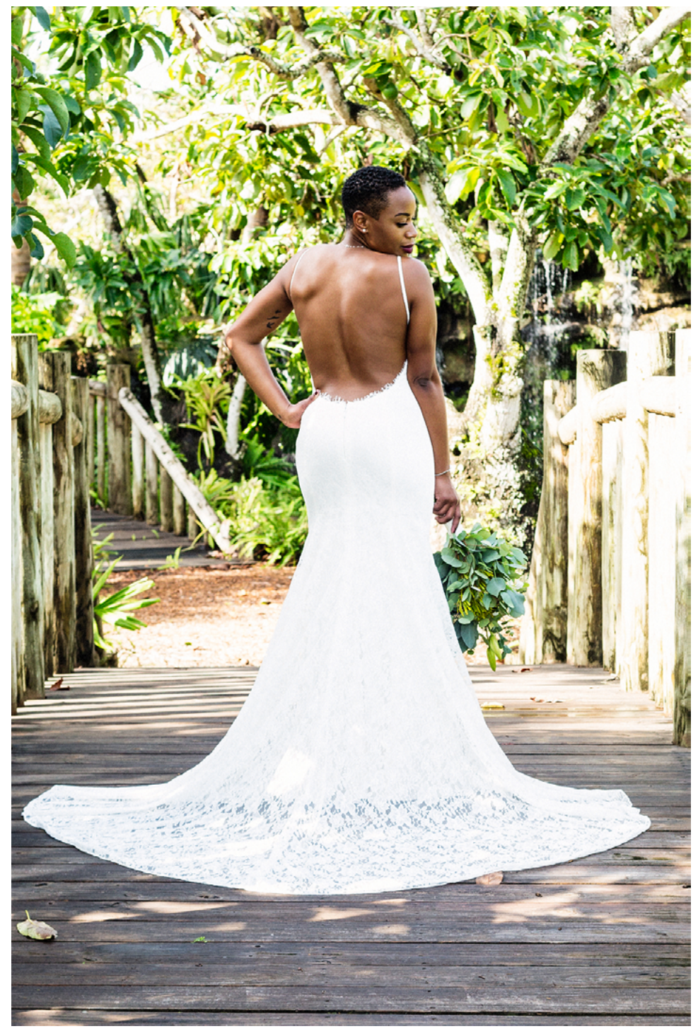
THE OLD GROVE IN REDLAND FLORIDA