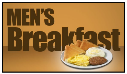
MEN'S BREAKFAST Friday, April 11 at 8 am Rose & Willow - MPR