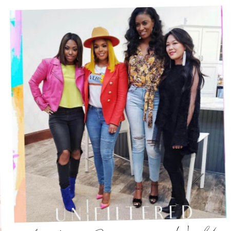
Unsittered Conference - World Changers Church International