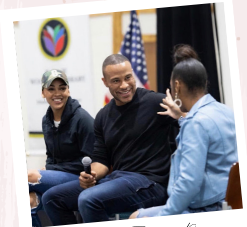
The Truth Tour w/ Devon Franklin and Meagan Good