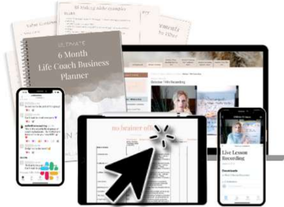
$10K IN 10 HOURS