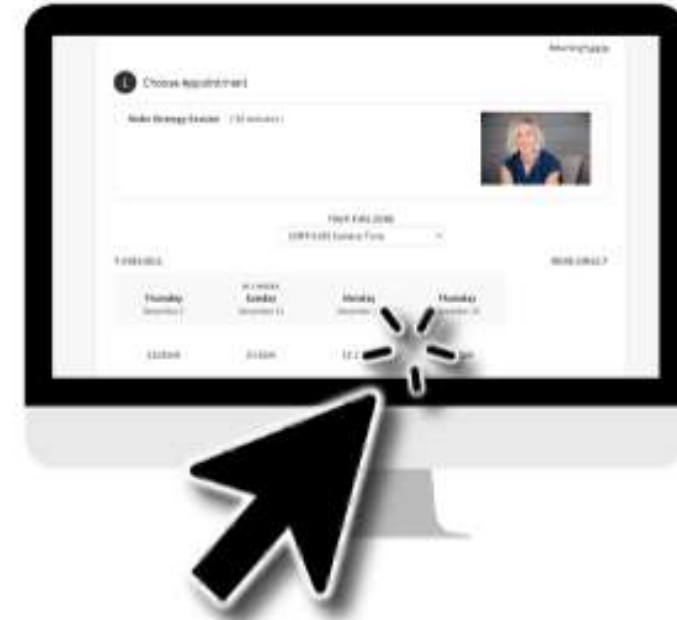
BOOK YOUR NICHE STRATEGY CALL