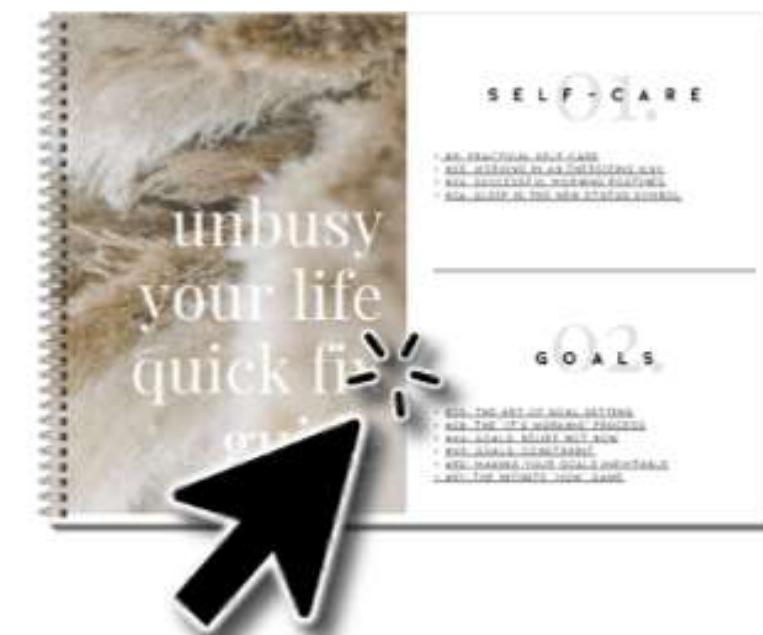
NEILL'S UNBUSY YOUR LIFE PODCAST QUICK FIX GUIDE