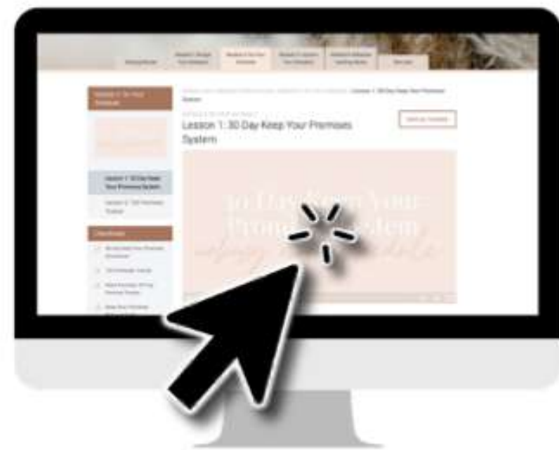
UNBUSY YOUR SCHEDULE COURSE