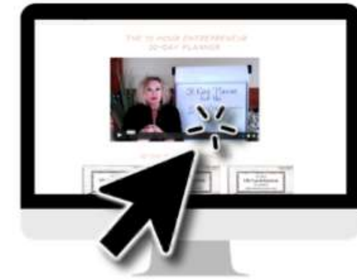
30 DAY PLANNER MATERIALS