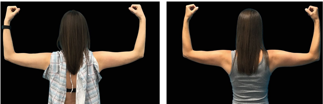
Figure 3: Female at baseline (left) and 3 months after treatment (right). Compared to baseline, this subject shows better triceps muscle definition and improved upper arm tone.