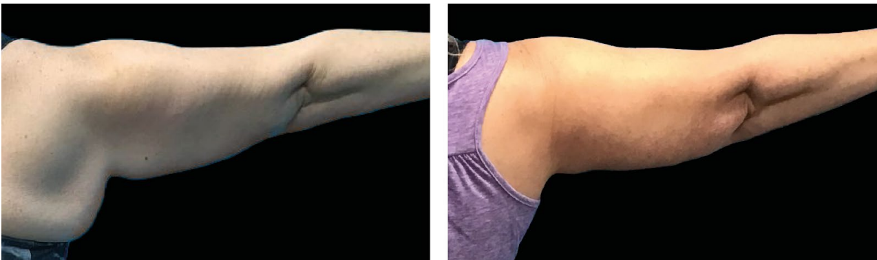
Figure 1: At baseline, the subject showed greater amount of upper arm adiposity, which hung rather loosely. 3-month photographs show upper arm tightening accompanied by marked decrease in arm fat.