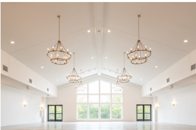
Reception Space

Inside the venue you will see clean lines, white walls, high ceilings, and dramatic chandeliers. The neutral color palette, gold light fixtures, and subtle black accents throughout the venue gives The Eloise an elegant timeless look.