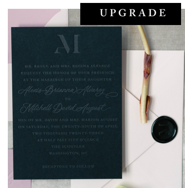
FOIL - $$$

Letterpress is a layered printing process that requires custom plates for each color and card used throughout the invitation suite. Once the design is run through the printing press, you are left with a beautifully debossed texture on the paper.