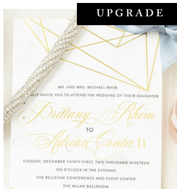
LETTERPRESS - $$

The most cost-efficient printing method. Digital printing will print your invitations smoothly without raised or indented impressions. Digital printing is also known as flat printing.