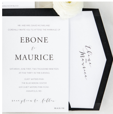
DIGITAL - $

We happily offer all of the listed print methods. Please inquire for a quote if you are interested in one of the processes below for your stationery.