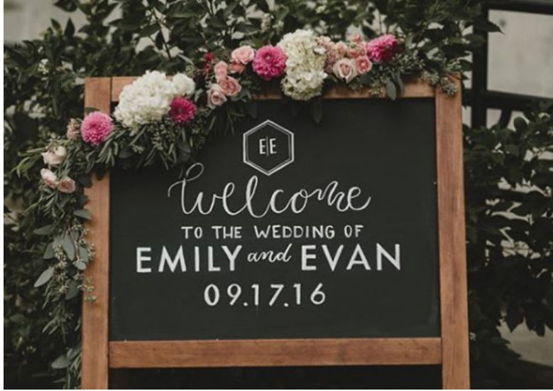
• EMILY & EVAN •

Robinson Creative House can do everything from Welcome Signs on chalkboard, menus on acrylic, or enormous seating chart installations on vintage windows.