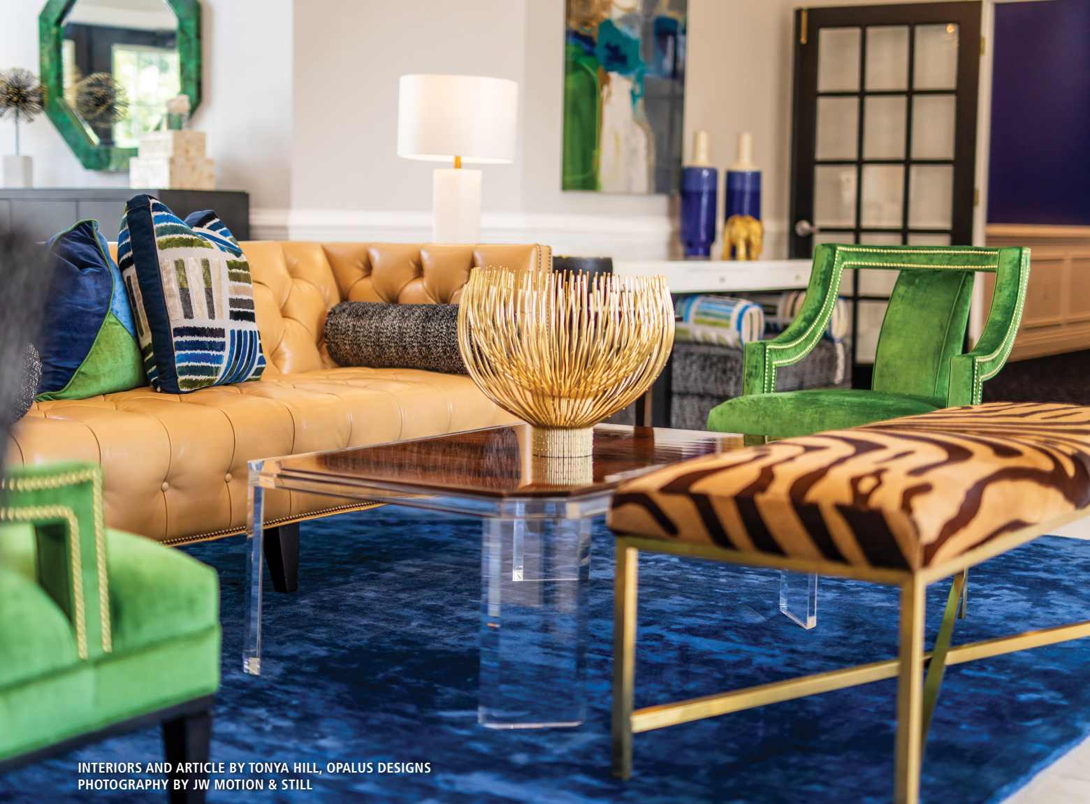
INTERIORS AND ARTICLE BY TONYA HILL, OPALUS DESIGNS