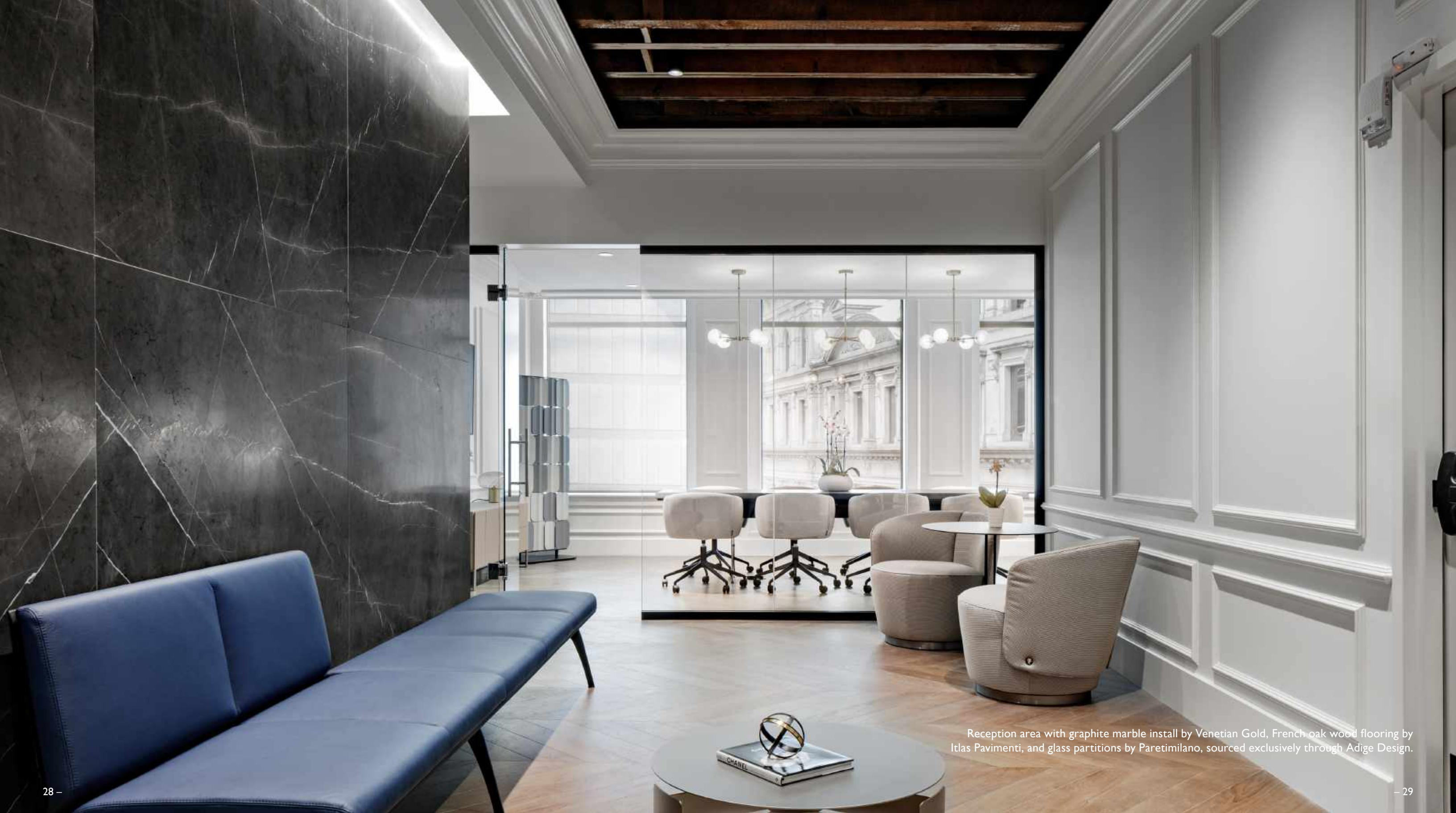
Reception area with graphite marble install by Venetian Gold, French oak wood flooring by Itlas Pavimenti, and glass partitions by Paretimilano, sourced exclusively through Adige Design.