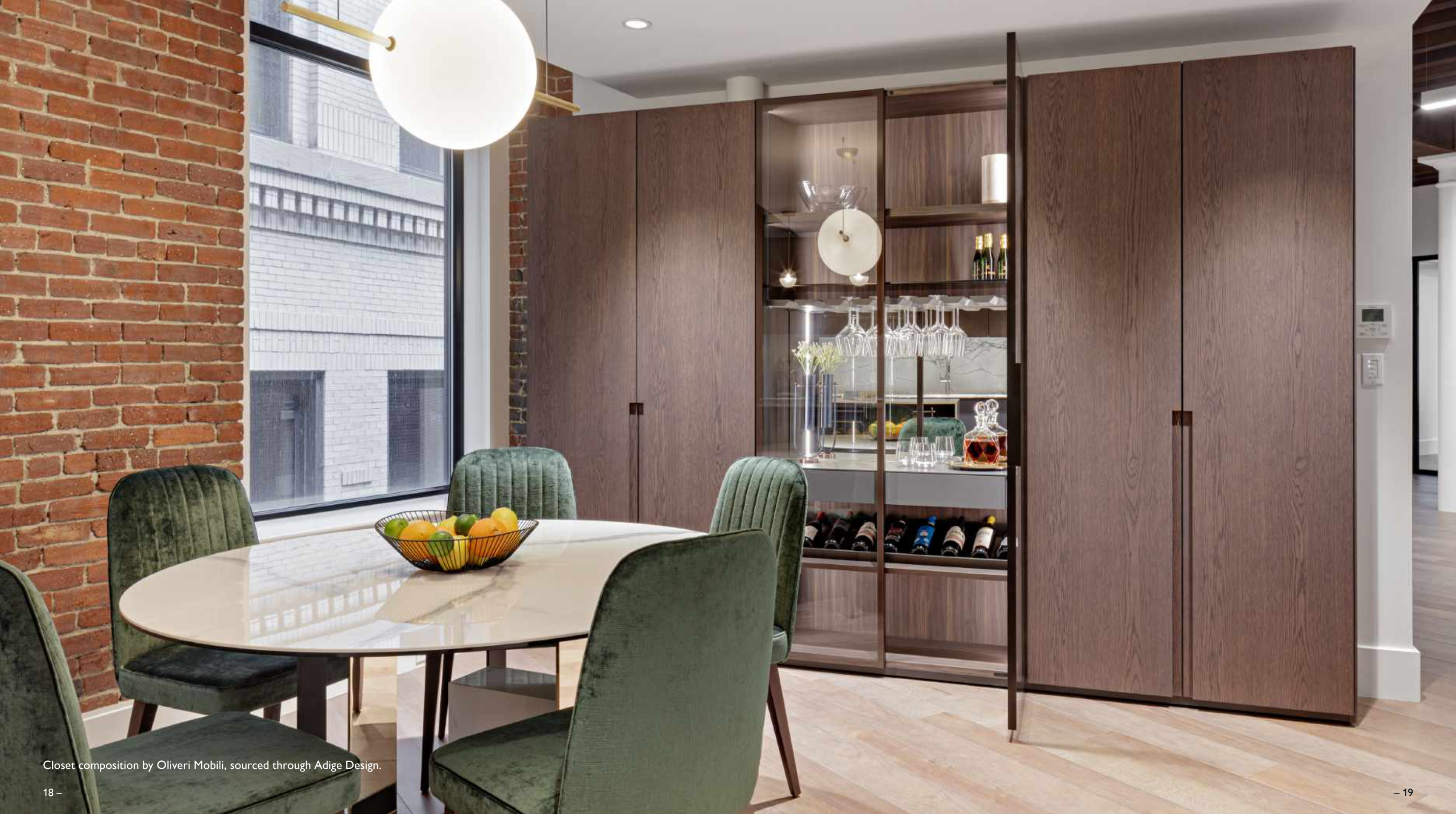
Closet composition by Oliveri Mobili, sourced through Adige Design.