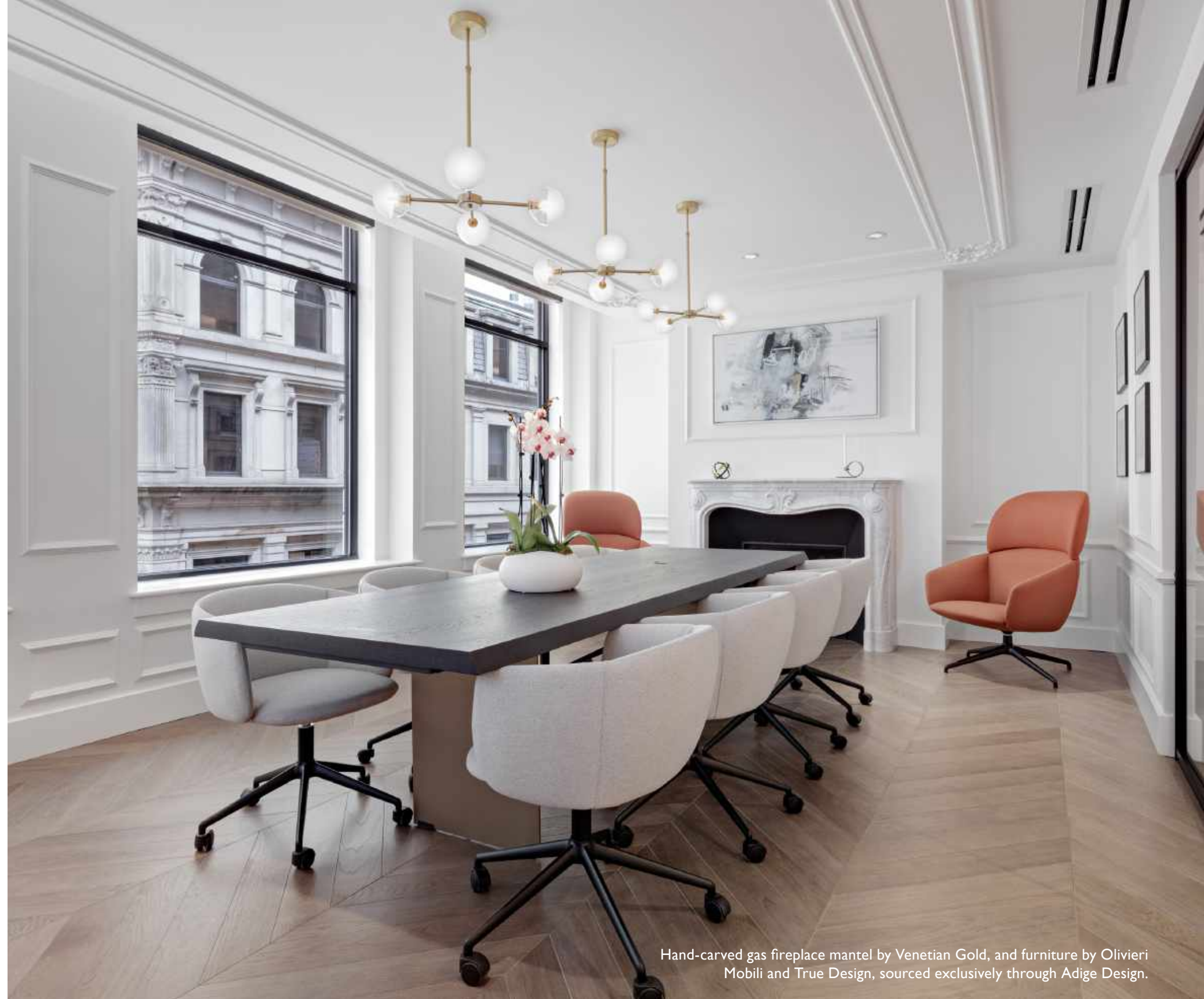
Hand-carved gas fireplace mantel by Venetian Gold, and furniture by Olivieri Mobili and True Design, sourced exclusively through Adige Design.