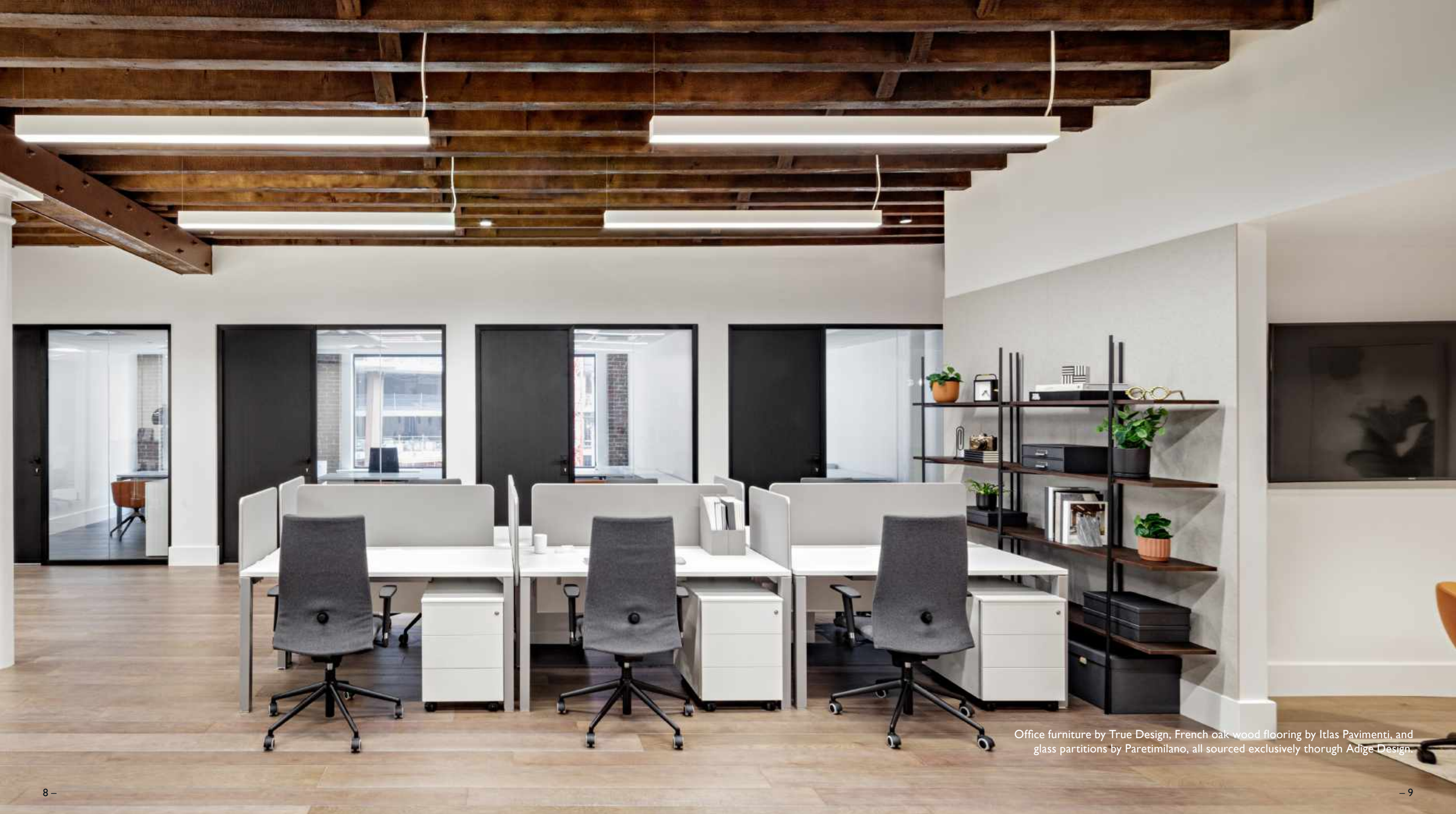
Office furniture by True Design, French oak wood flooring by Itlas Pavimenti, and glass partitions by Paretimilano, all sourced exclusively thorough Adige Design.