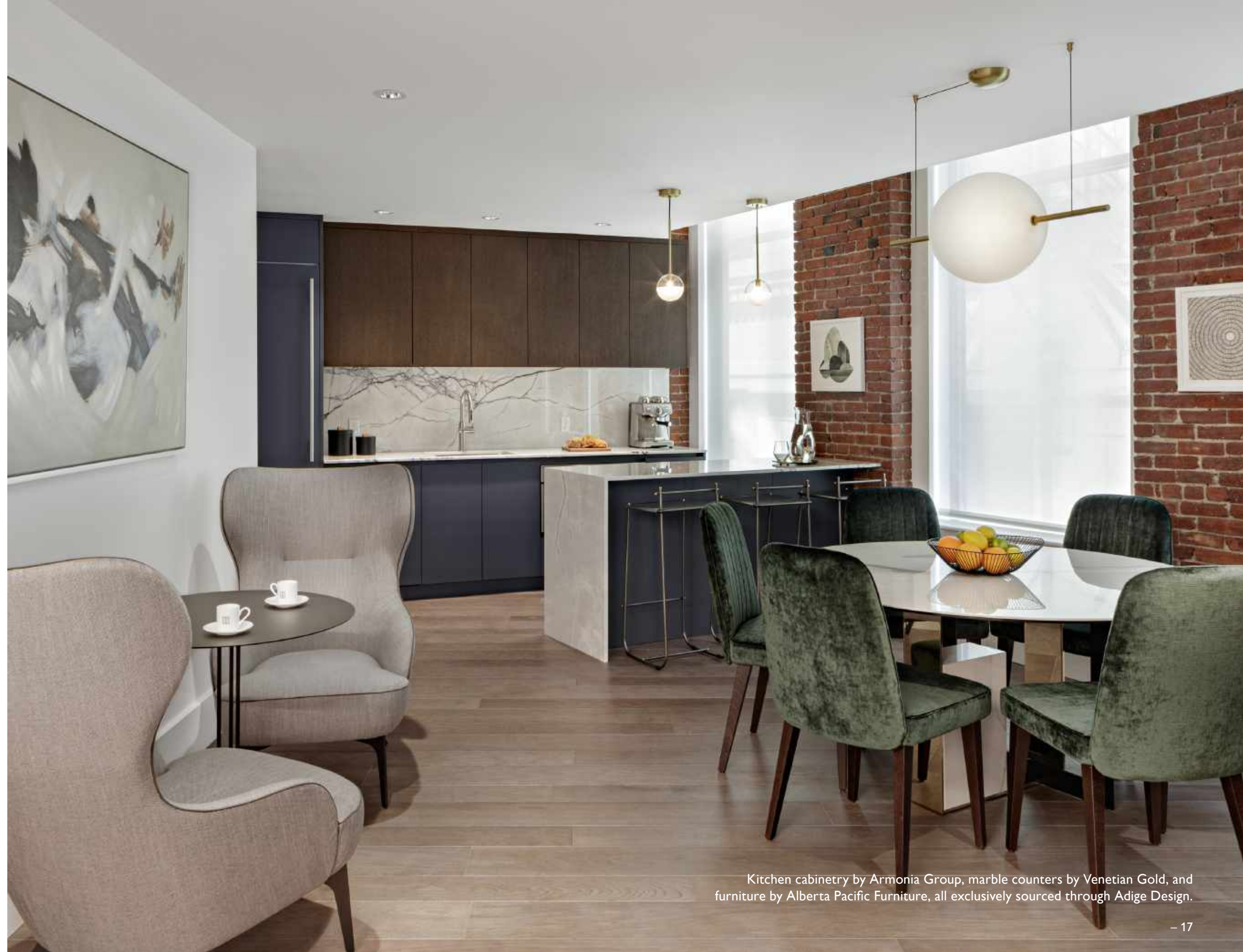
Kitchen cabinetry by Armonia Group, marble counters by Venetian Gold, and furniture by Alberta Pacific Furniture, all exclusively sourced through Adige Design.