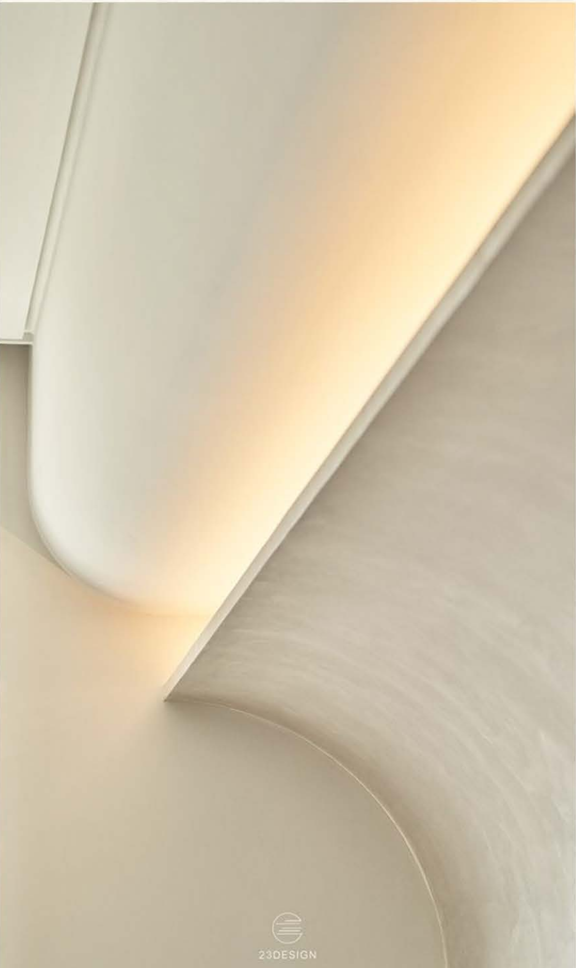
LED STRIP & COVE LIGHTING