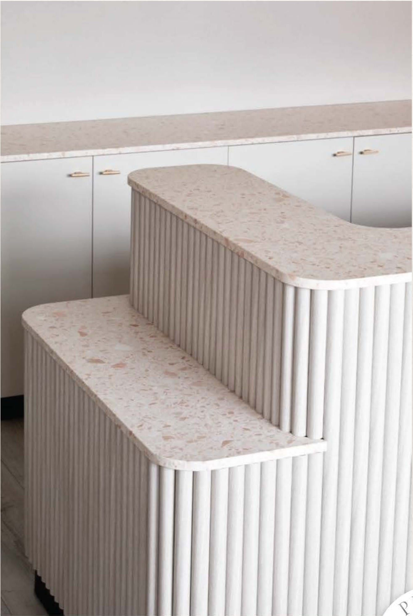
STYLE OPTION 2