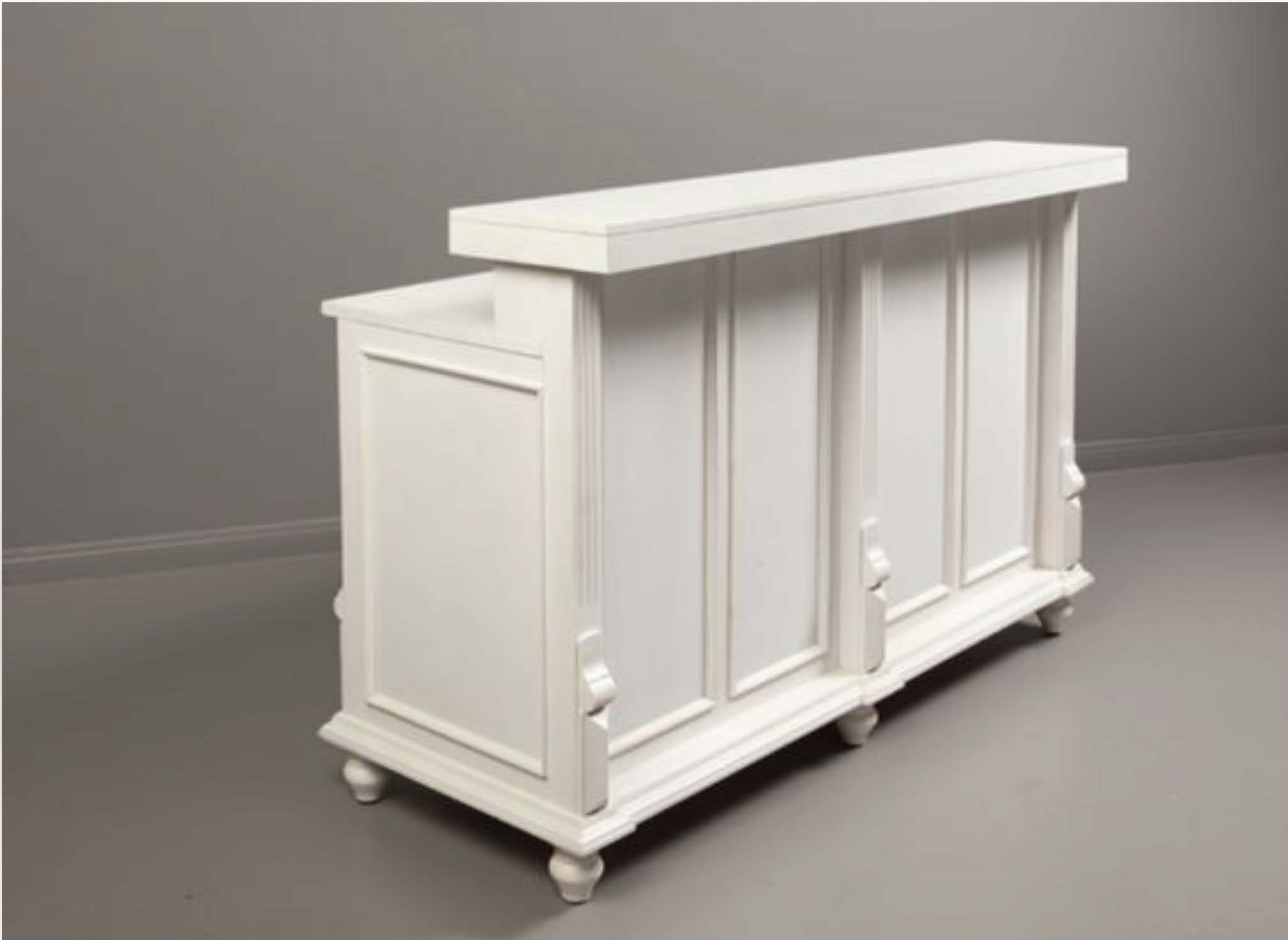
STYLE OPTION 1