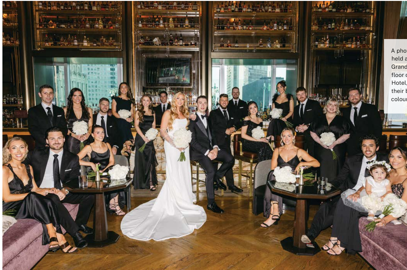
A photo session was held at The Louix Louis Grand Bar on the 31st floor of the St. Regis Hotel, which matched their black-and-white colour scheme.