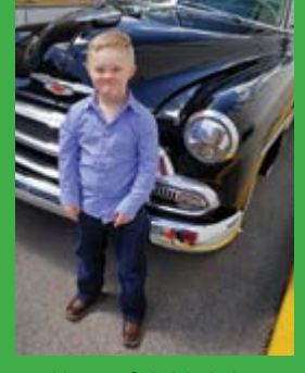
Happy 8th birthday