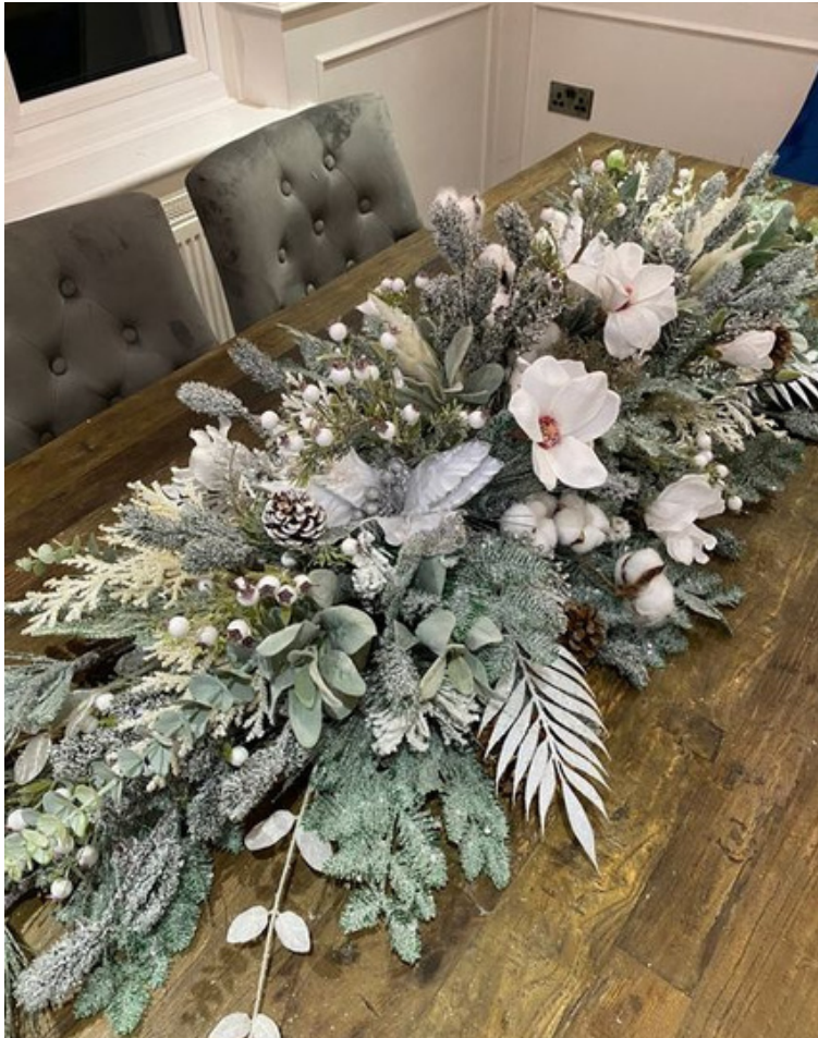
TABLE GARLAND PER FOOT