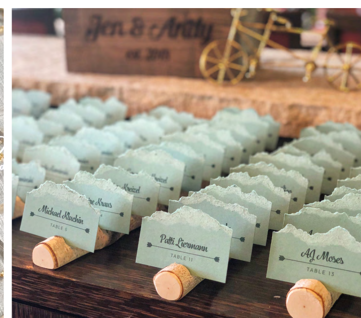
TABLE ASSIGNMENT BOARDS, PLACE CARDS, & ESCORT CARDS