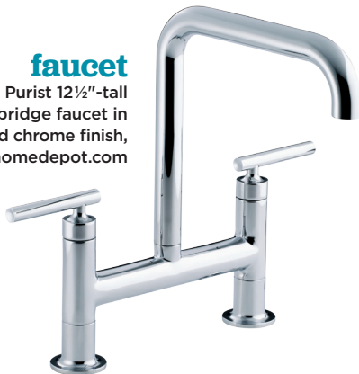
faucet Kohler Purist 12½"-tall metal bridge faucet in polished chrome finish, $705, homedepot.com