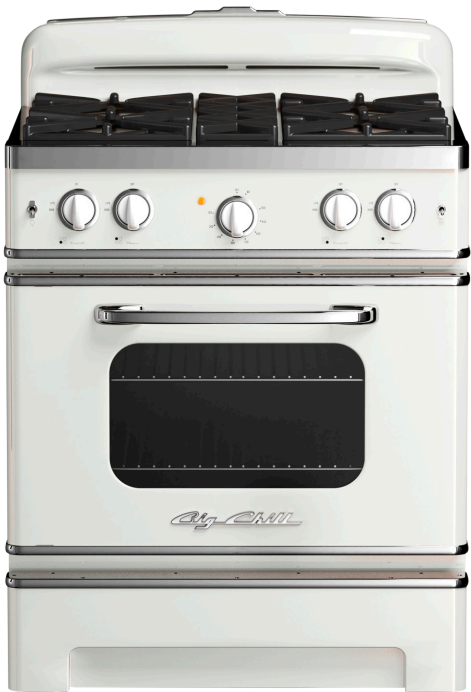
stove Retro 30" stainless steel and chrome stove in white, $4,495, bigchill.com