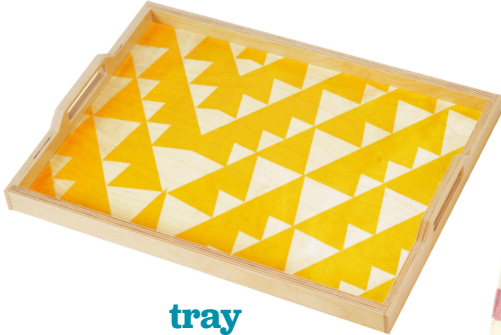
tray Yellow Triangle 14" x 19" Baltic birch tray, $68, wolfum.com