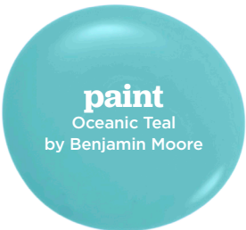
paint Oceanic Teal by Benjamin Moore