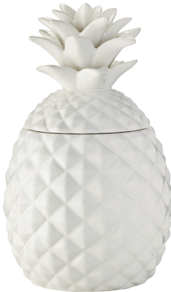
cookie jar Pineapple 12¼"H x 7"-diameter ceramic cookie jar, $15, worldmarket.com