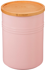
canister 5"H x 4"-diameter stoneware and wood canister in hibiscus, $35, lecreuset.com