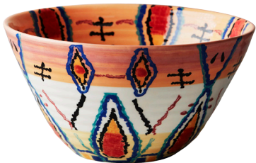
serving bowl Tularosa 8½"-diameter stoneware bowl in multi, $48, anthropologie.com

floor and rug At first Rebecca considered replacing the tired old linoleum with hardwood, but large matte gray porcelain tiles from Arizona Tile won out because they’re durable and easy to mop. “The finish is really natural-looking, like grayed driftwood,” she says. The flat-weave wool and cotton rug is from Aelfie.