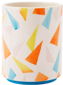
utensil crock Roar + Rabbit 7¼"H x 6"-diameter terra-cotta cachepot in triangles, $19, westelm.com