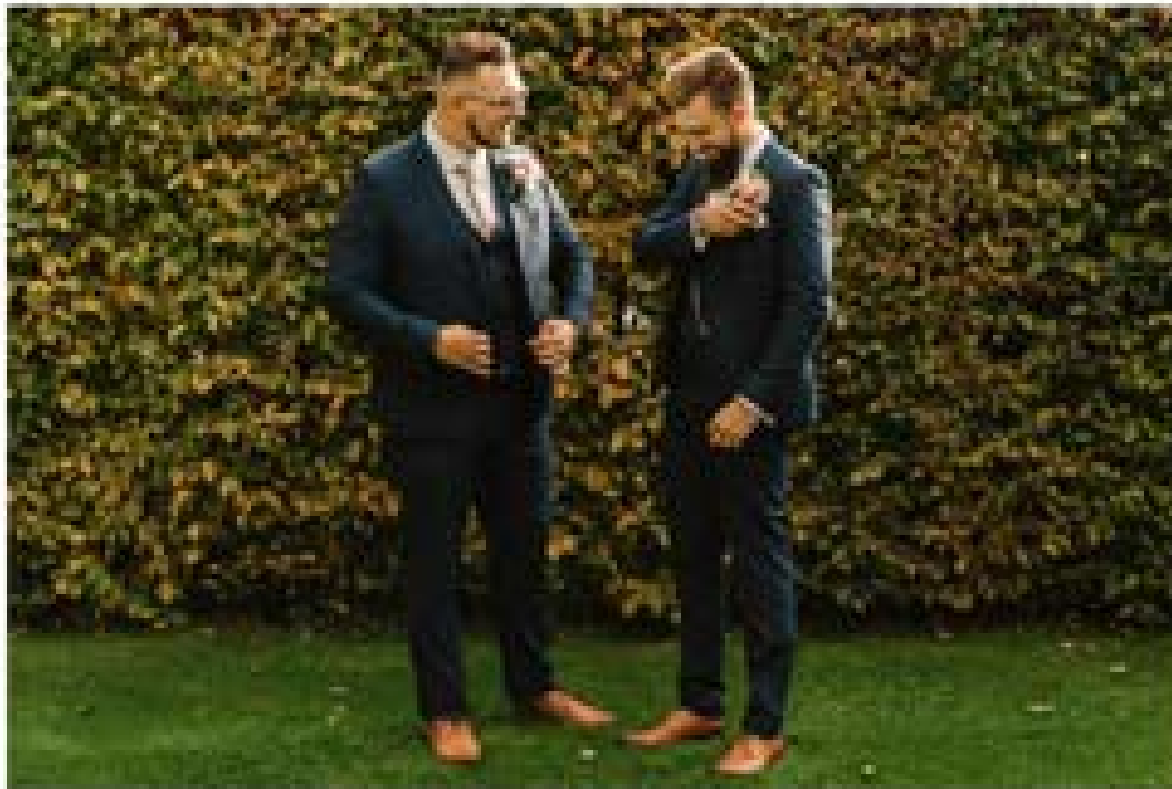
Wedding party group photographs

These shoots normally take place before the couple portraits, once you've socialised and had a drink with your guests, I will gather you and the wedding party to head off within the premises away from the guests. And this is the fun part to let your hair down with your favourites and have some fun. I will always have a shoot list with me to assist you all, but go with wherever the shoot takes you, for example to break the ice I suggest a walking one, bump hips and do some drunk cheerily walking, it does sound strange but captures some joyful moments and even the shyest person starts to enjoy the camera.