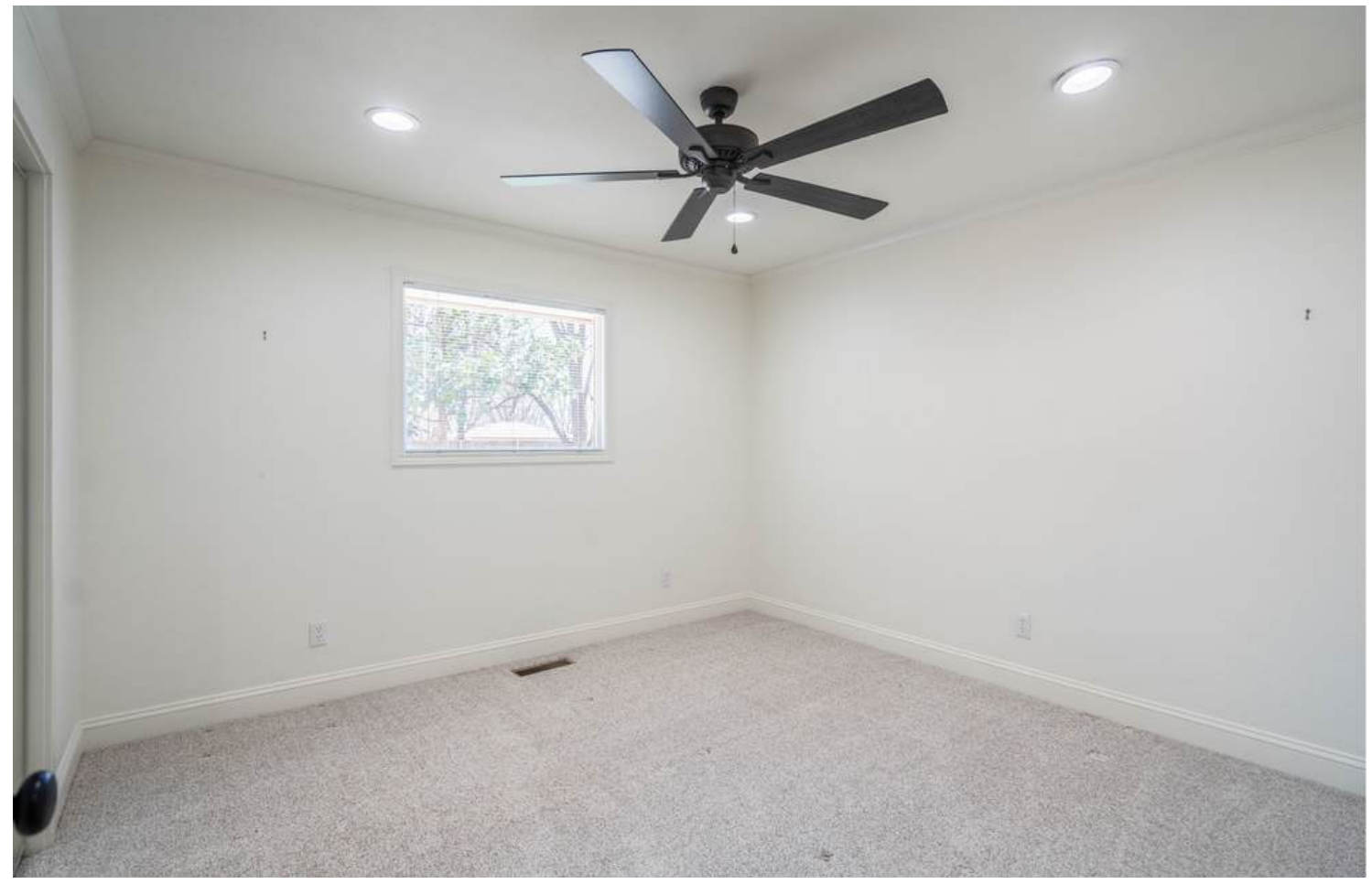
CAPITAL REALTY GROUP AT FATHOM REALTY