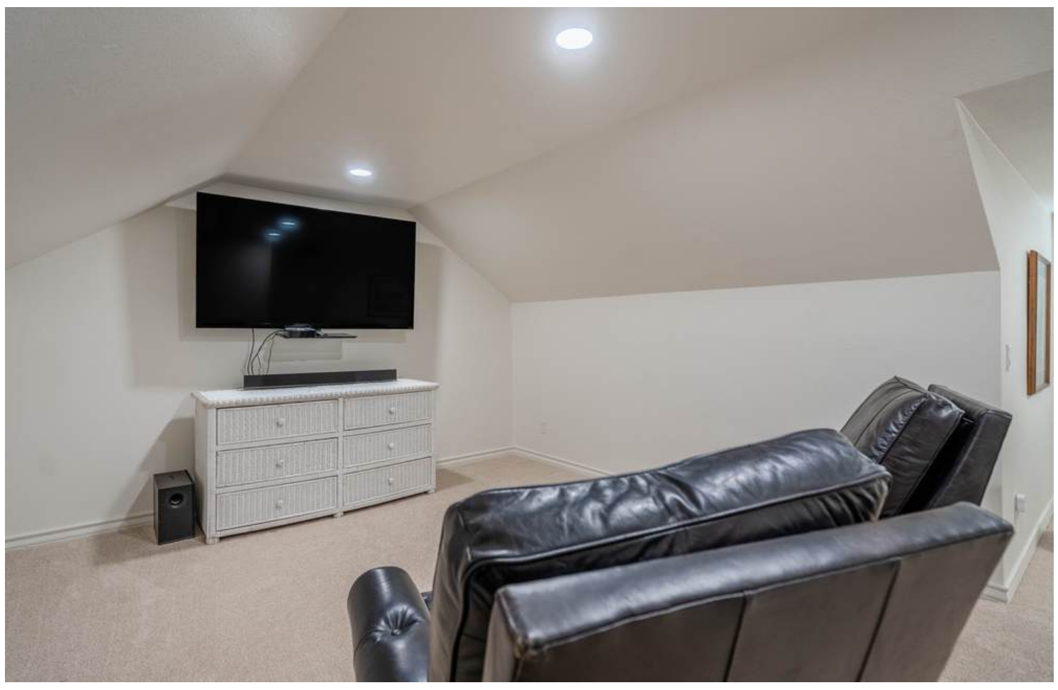
CAPITAL REALTY GROUP AT FATHOM REALTY