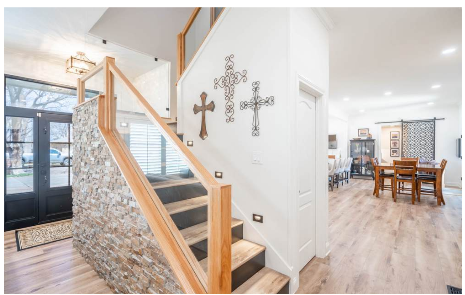
CAPITAL REALTY GROUP AT FATHOM REALTY