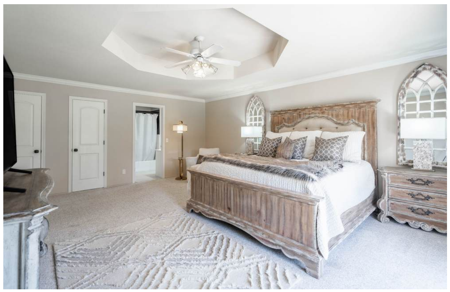
CAPITAL REALTY GROUP AT FATHOM REALTY