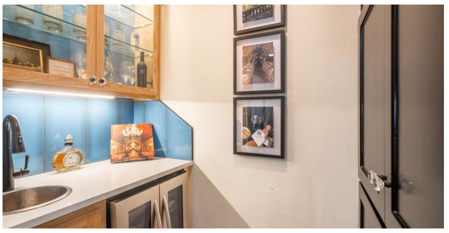
CAPITAL REALTY GROUP AT FATHOM REALTY