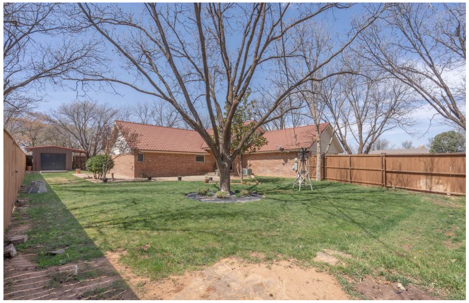
CAPITAL REALTY GROUP AT FATHOM REALTY