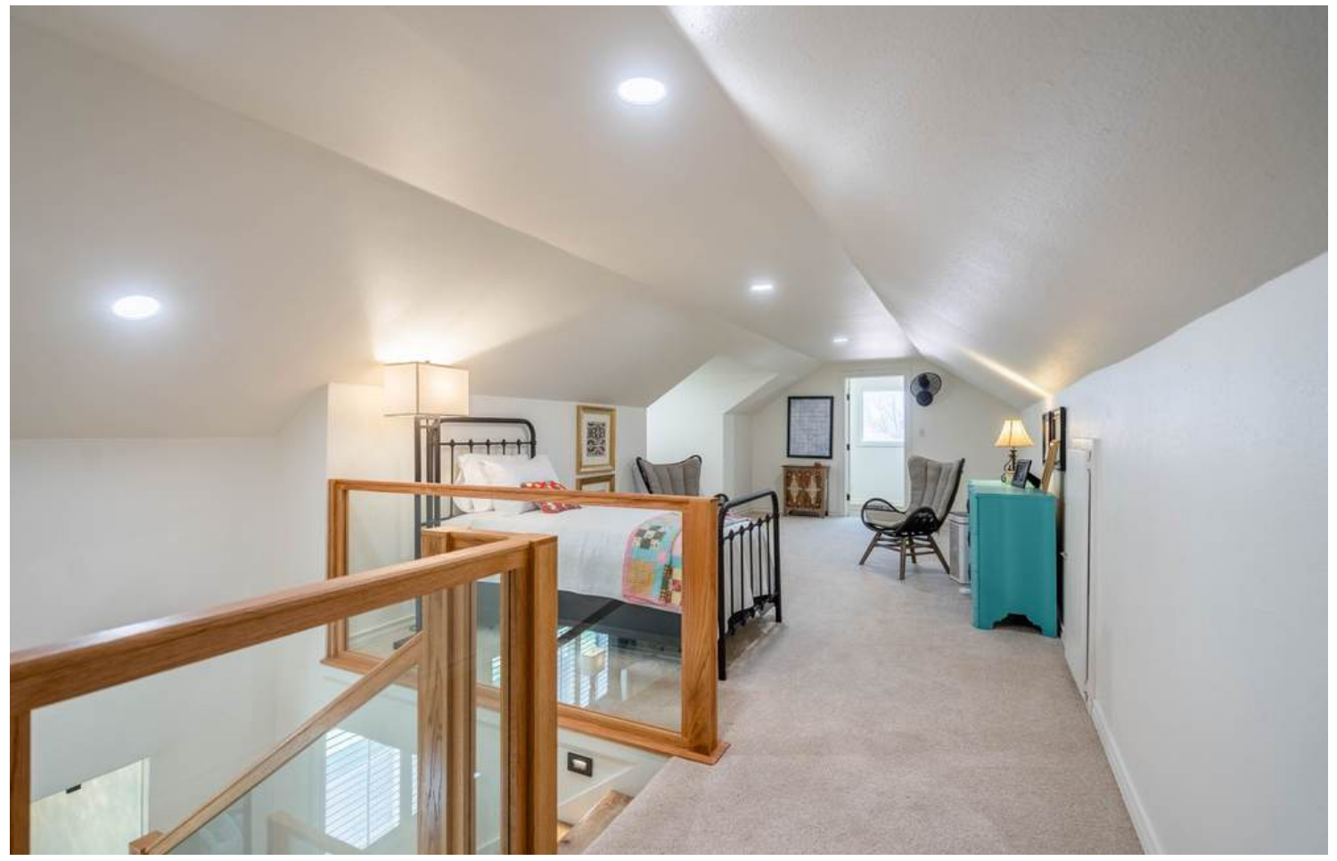
CAPITAL REALTY GROUP AT FATHOM REALTY