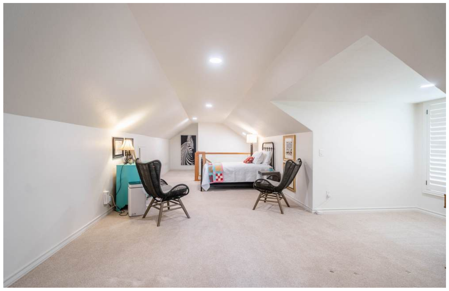
CAPITAL REALTY GROUP AT FATHOM REALTY