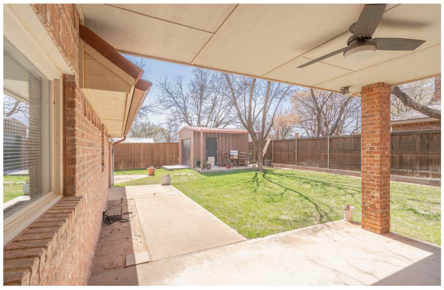
CAPITAL REALTY GROUP AT FATHOM REALTY