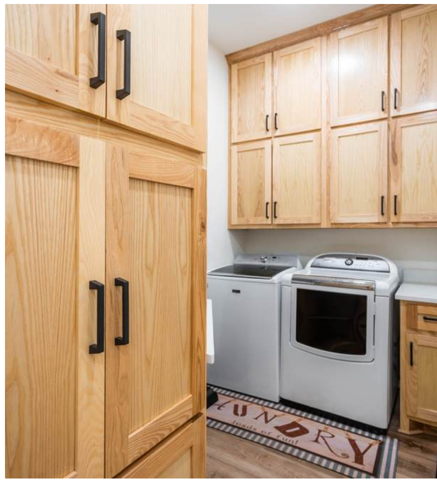
CAPITAL REALTY GROUP AT FATHOM REALTY