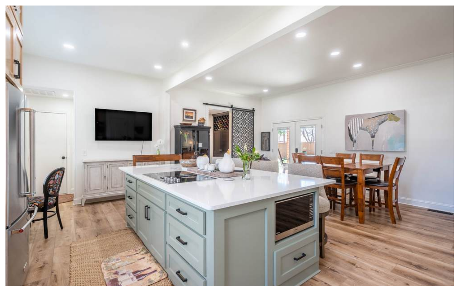
CAPITAL REALTY GROUP AT FATHOM REALTY